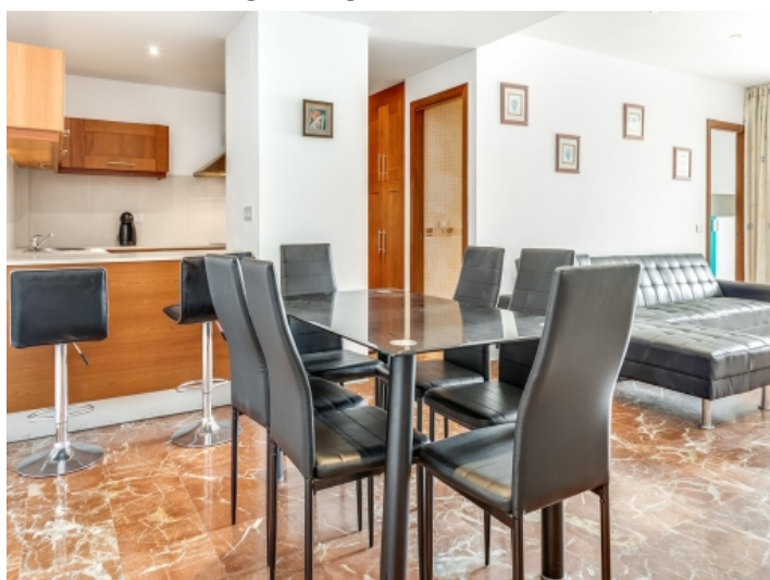
Friendly dining area with open kitchen