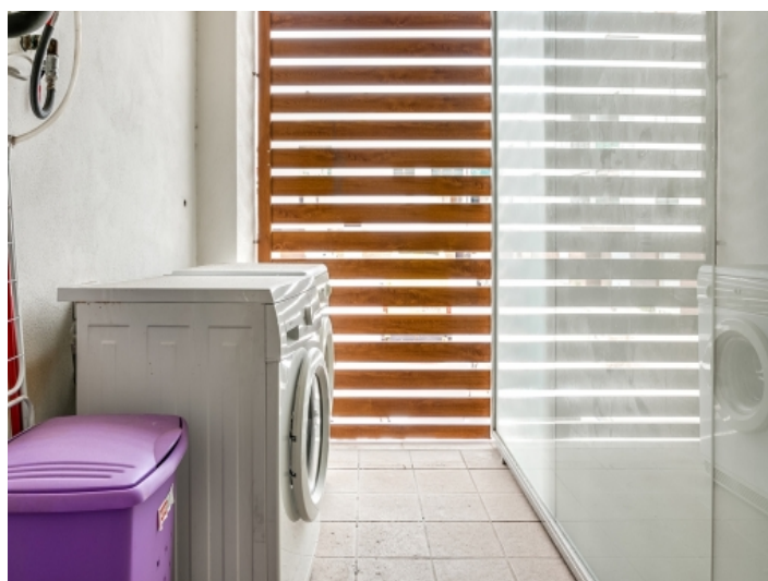
Storage or washing room