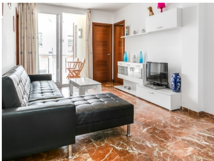
Bright living area with terrace