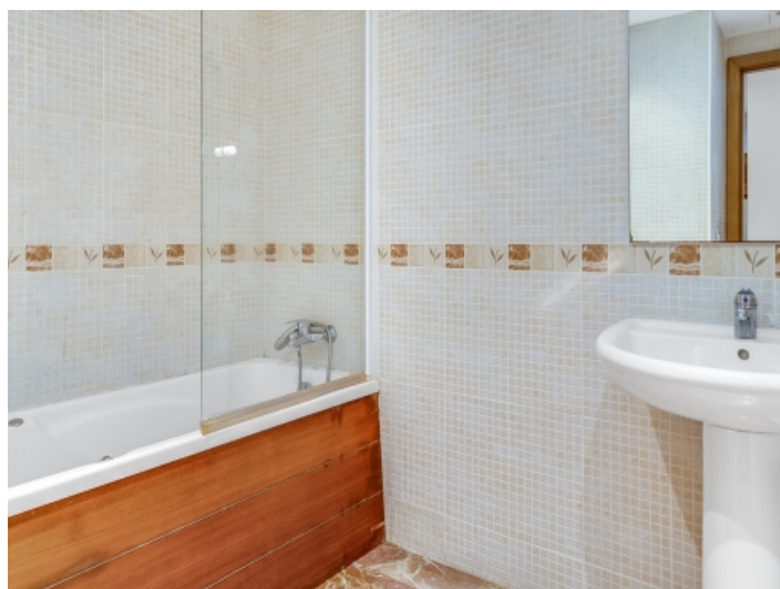
The second bathroom with bathtub