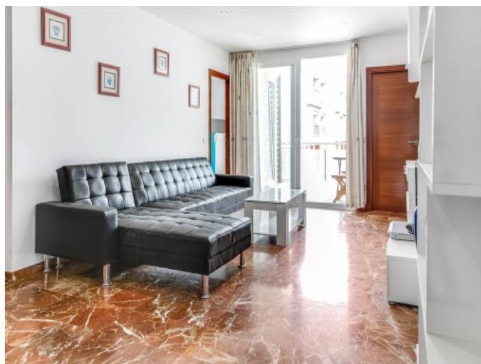
Alternative view of the spacious living area