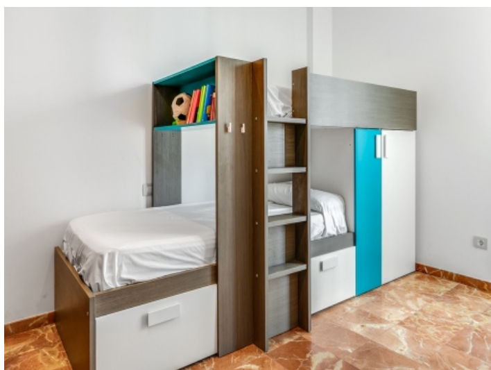
The third bedroom with loftbed