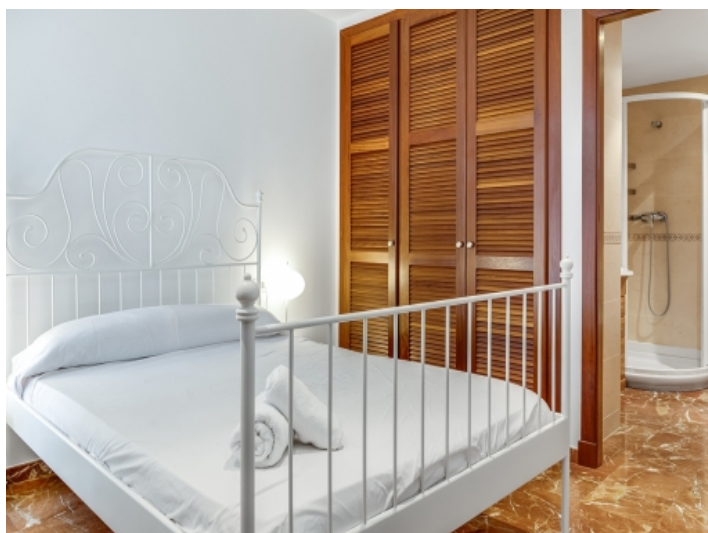
Double-bedroom with built-in wardrobe