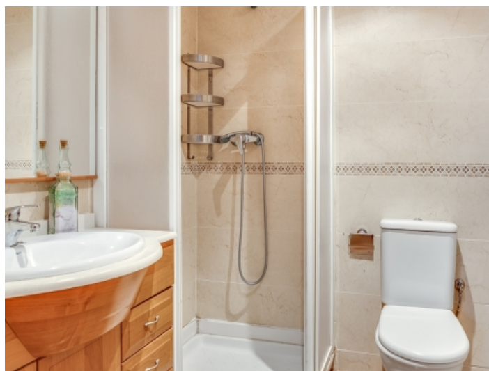
Bathroom en suite with shower