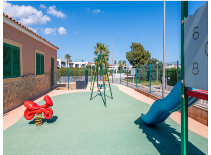
Play ground in community area