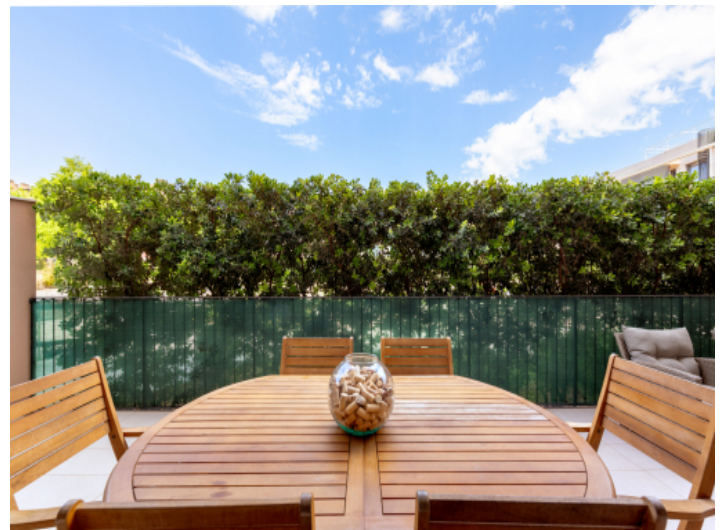
Terrace with privacy