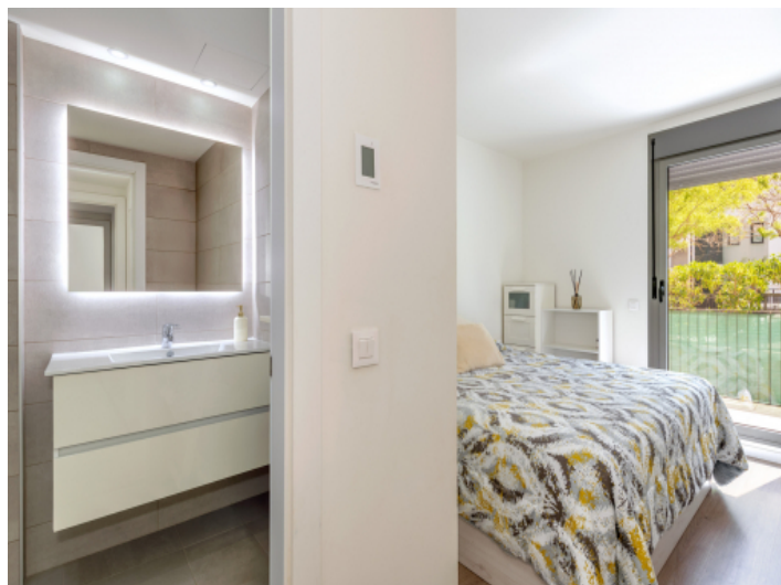
Bedroom in suite