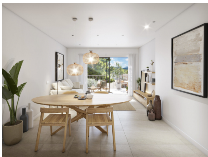
View from the kitchen?