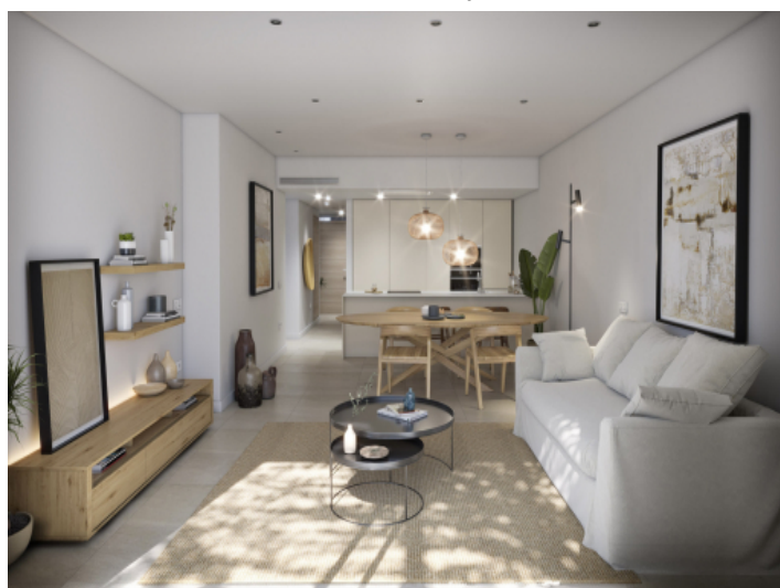
View from the kitchen?