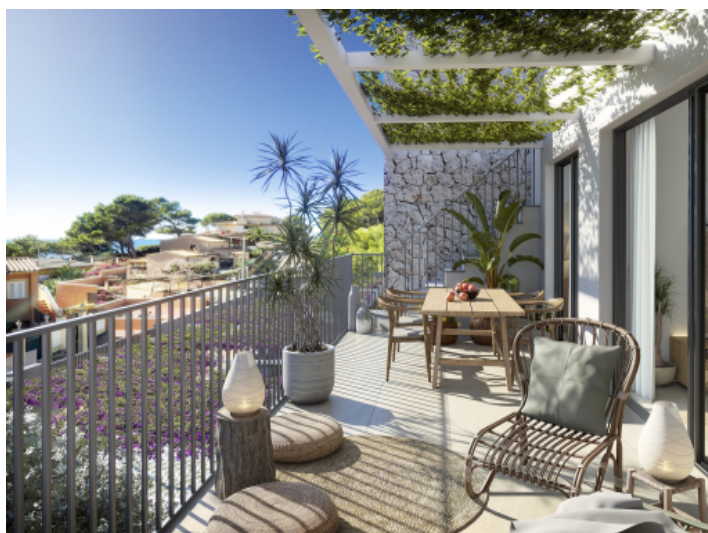
Balcony on main living level?