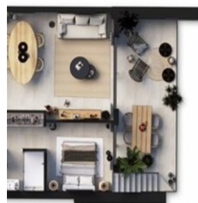
Penthouse floor plan?