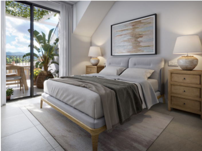
Master bedroom with terrace access?