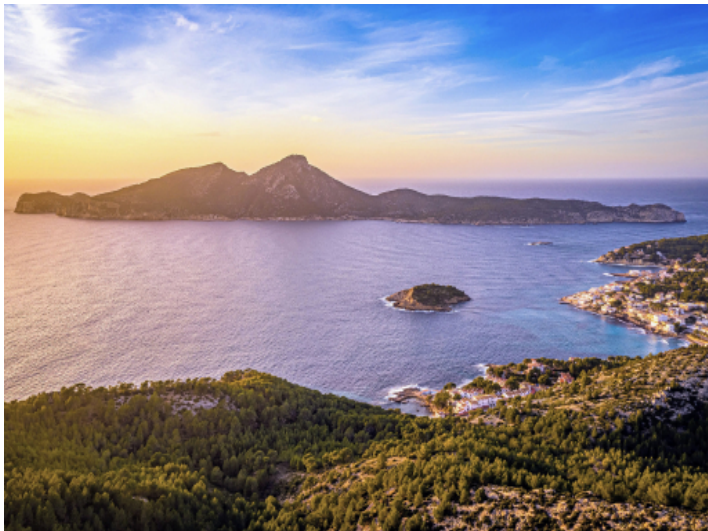
Dragonera at sunset?