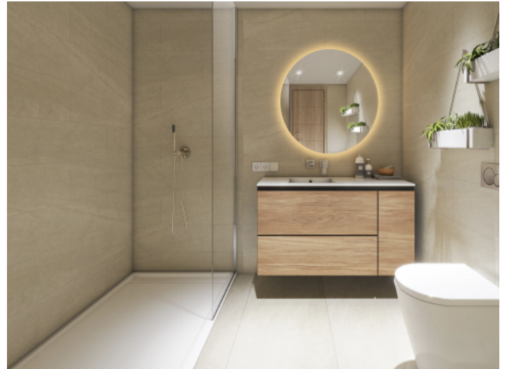
Bathroom with large shower?