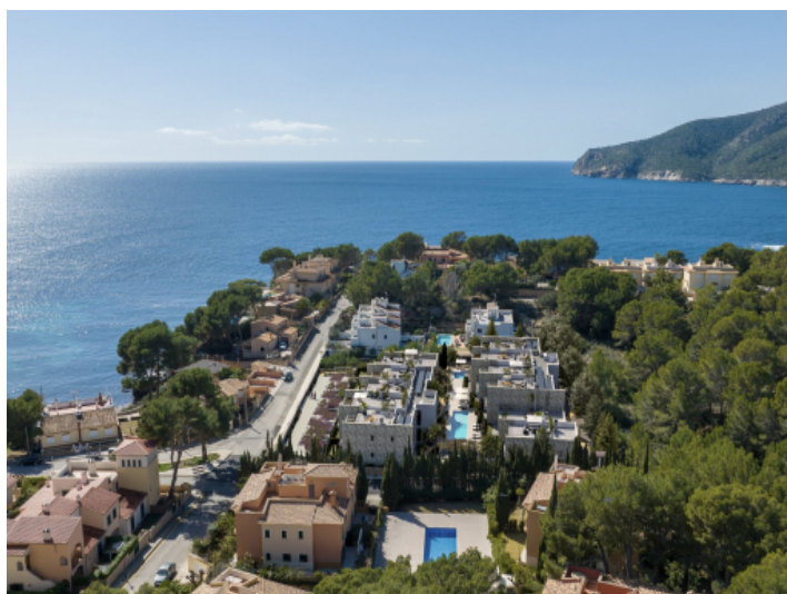
View over the complex?