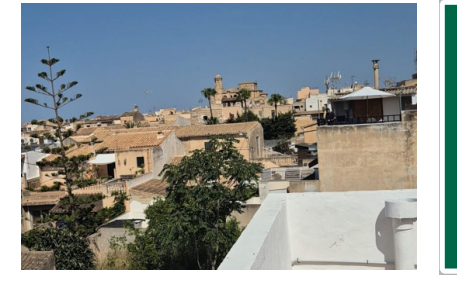
Llucmajor search for property MAL-122288