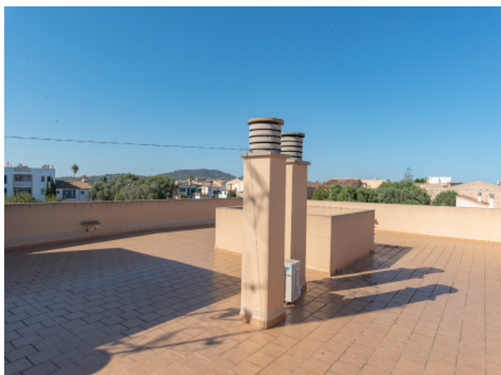
Big community rooftop terrace