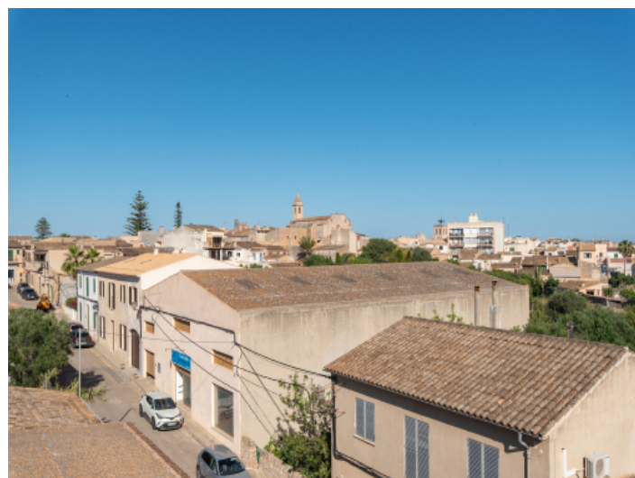
View to the church