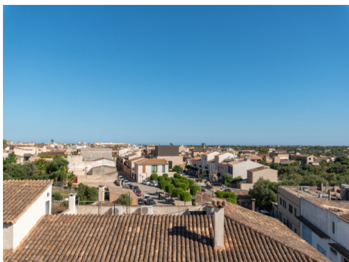
Far reaching views