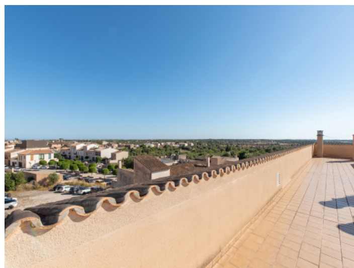
Community rooftop terrace