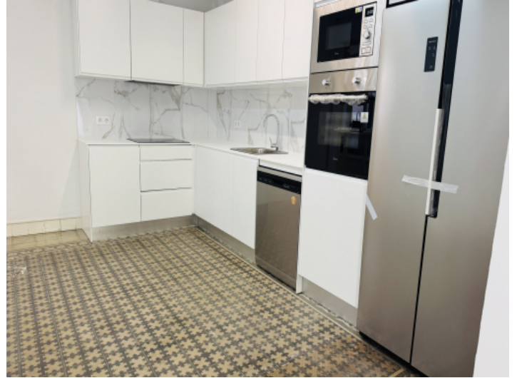
Fully equipped new kitchen