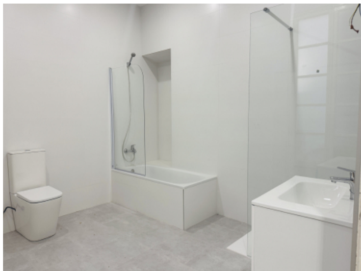
One of the 2 bathrooms