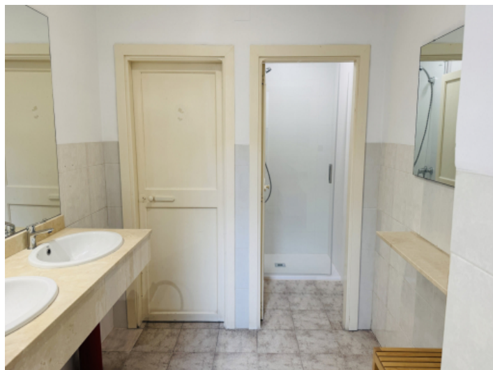
One of the two bathrooms