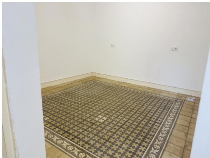
One of the four bedrooms