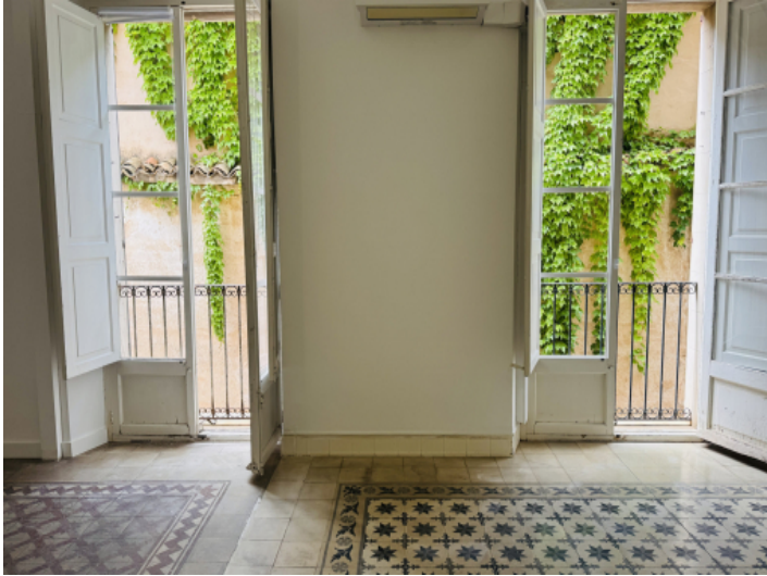
View from the living-dining area