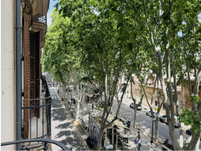
View from the balcony overlooking the Rambla