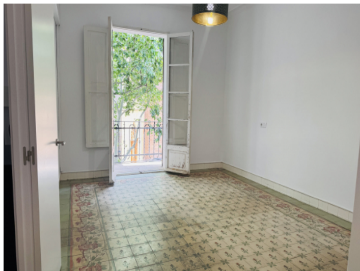
One of the four bedrooms