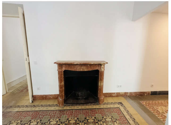
Fireplace in the living-dining area