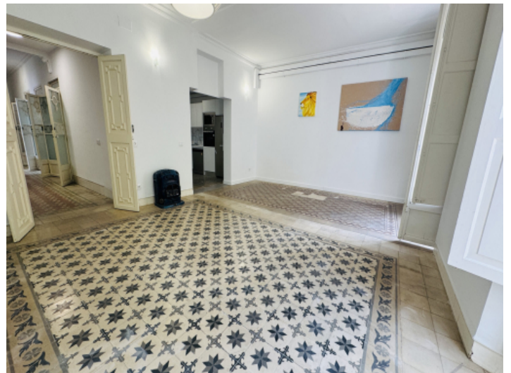
Second living-dining area