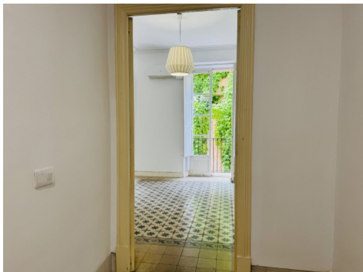
One of the four bedrooms