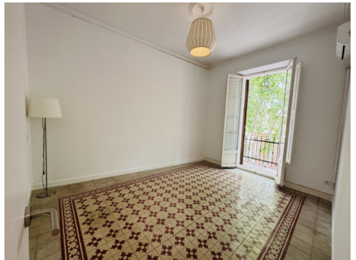
One of the four bedrooms