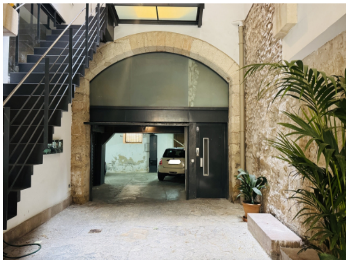
Entrance area with access to the garage