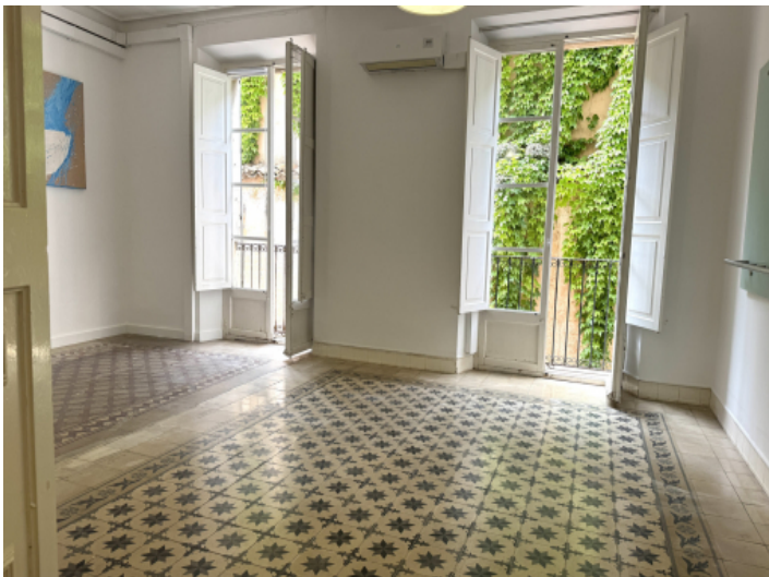
Second living room