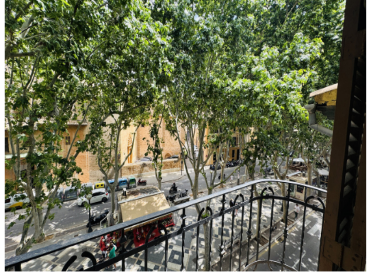
Balcony with a view of the Rambla