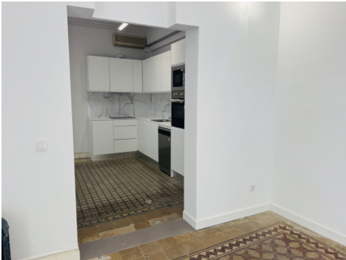
View from the living area into the kitchen