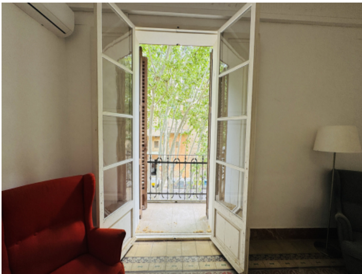
View from the dining area