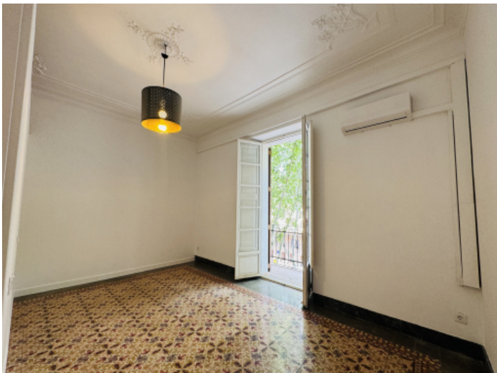
One of the four bedrooms