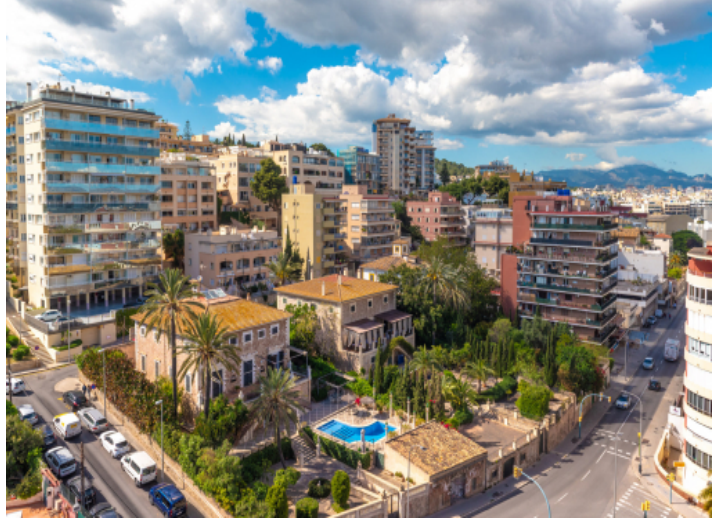
View to Bonanova