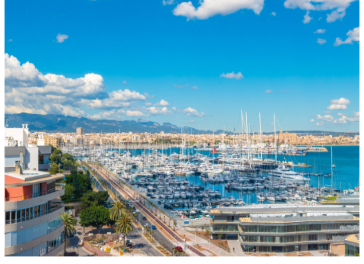
View to harbour