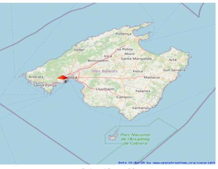
Palma/ Porto Pí