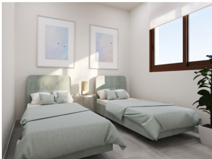
Elegant double bedroom