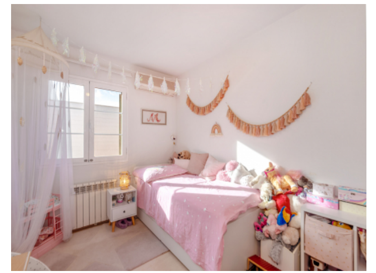
Bedroom Children's room