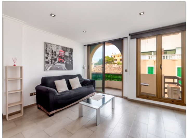
Living room with access to the balcony