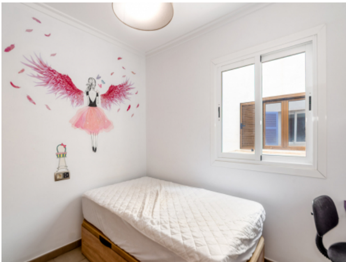
One of 3 bedrooms