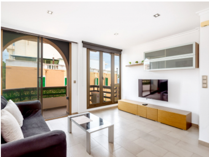
Light-flooded living room