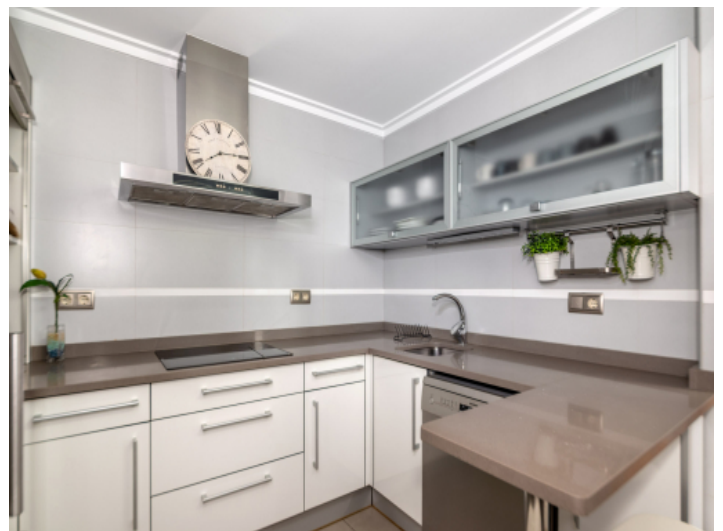
Fully equipped kitchen