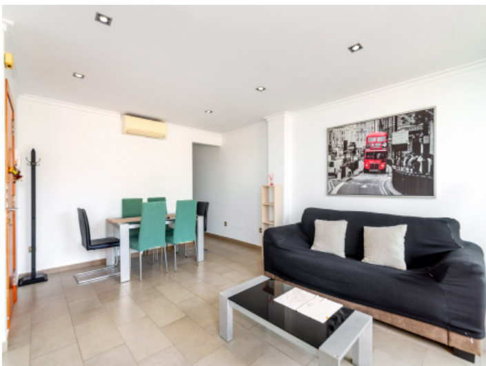
Open plan living and dining area