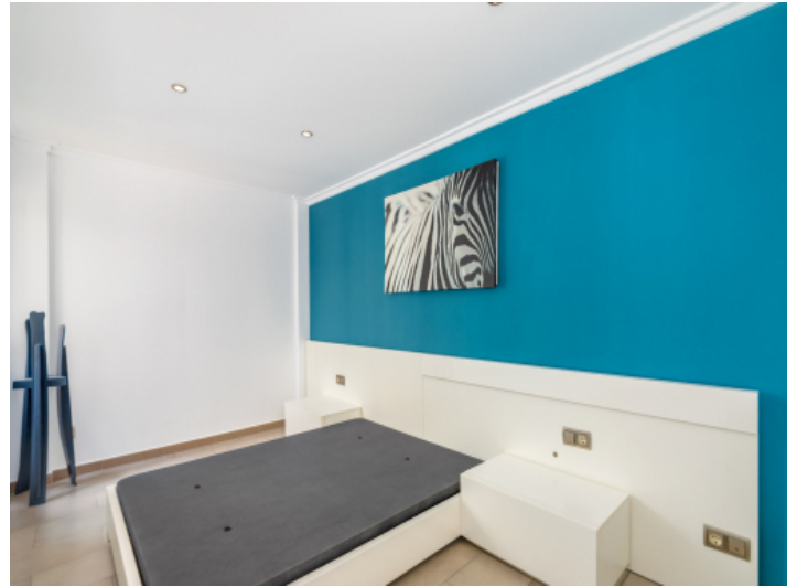
One of 3 bedrooms