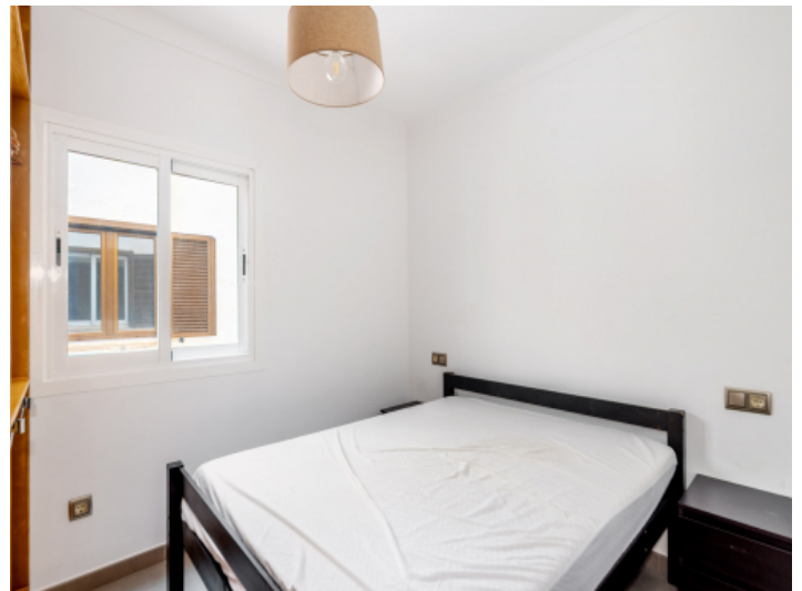
One of 3 bedrooms