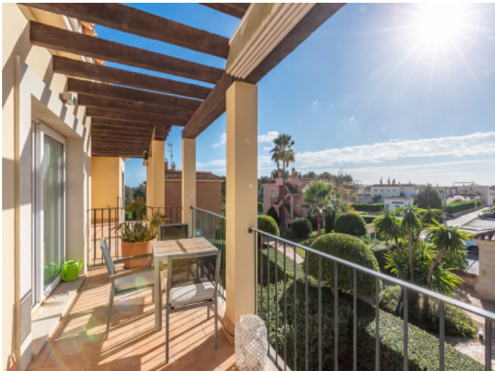
Terrace with views