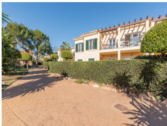
Fassade and community garden