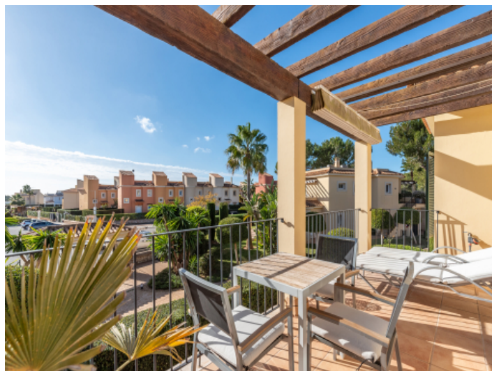
Terrace with views