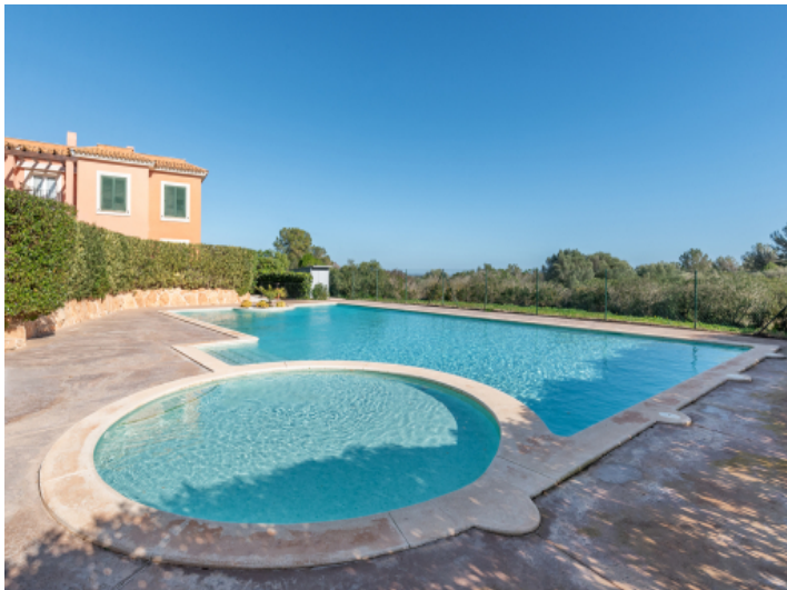
Very well maintained pool