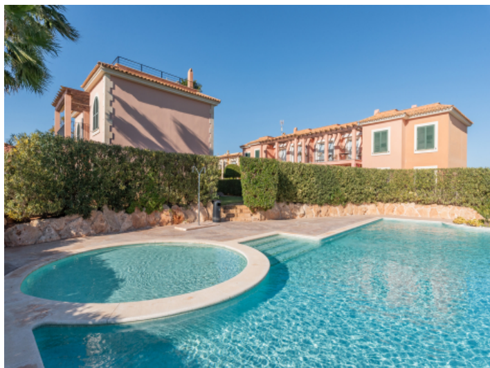
Beautiful community pool