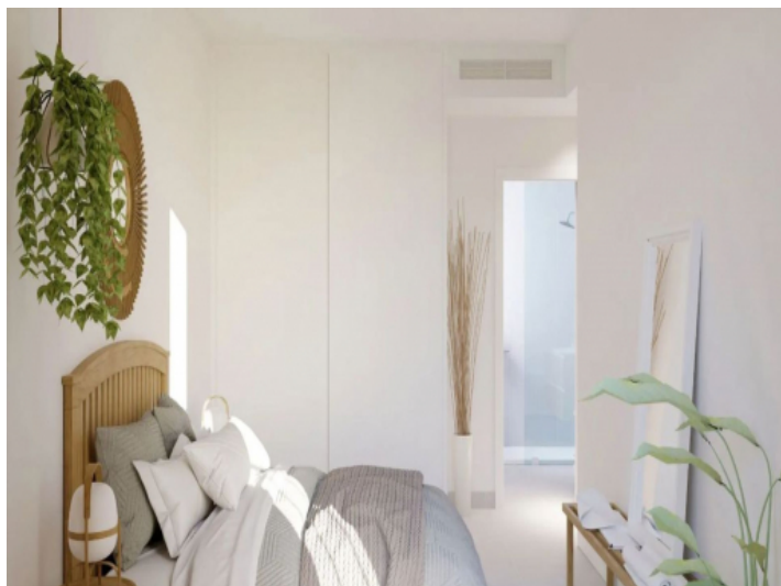
One of 3 bedroom