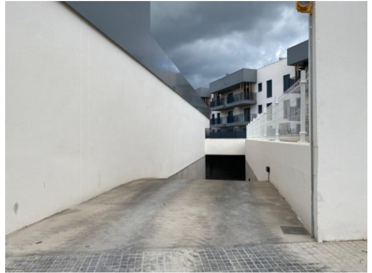
Access to the underground parking