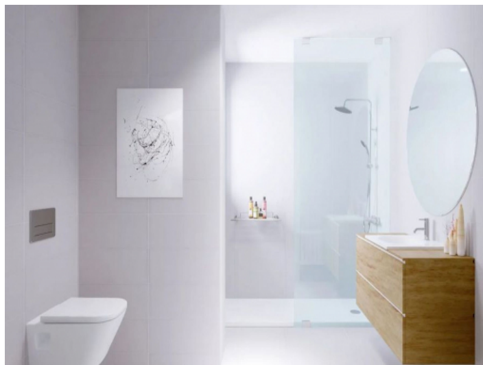
Flat with 2 bathrooms