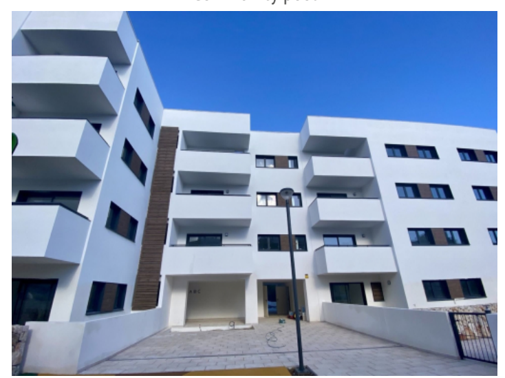
Entrance and façad3e