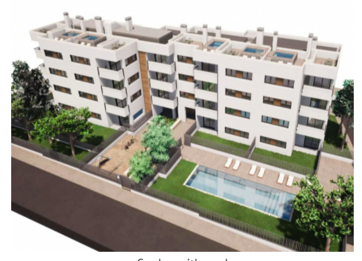
Garden with pool