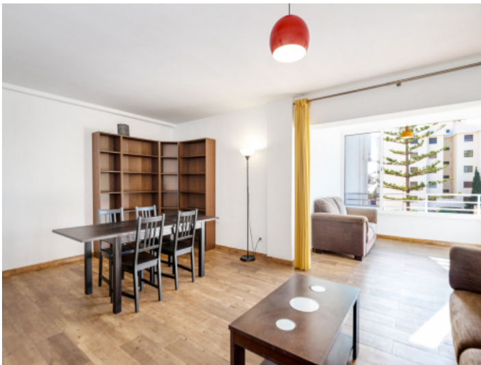
Light-flooded living and dining area