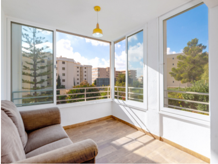
Apartment in a prime location in Portals Nous