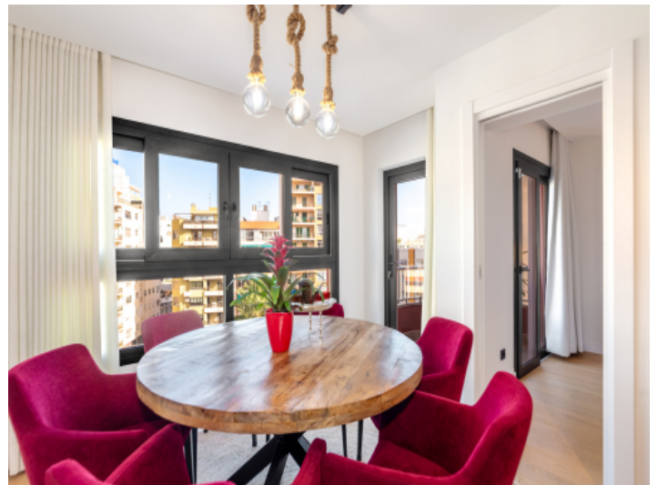
Bright dining room