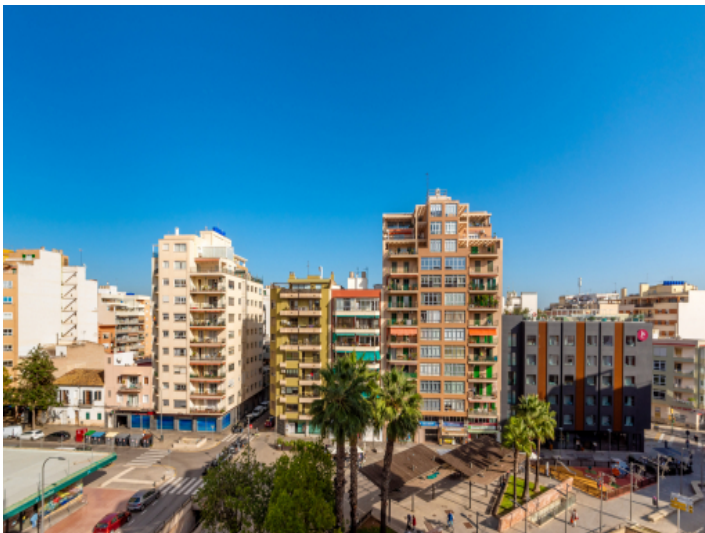
Balcony with city views