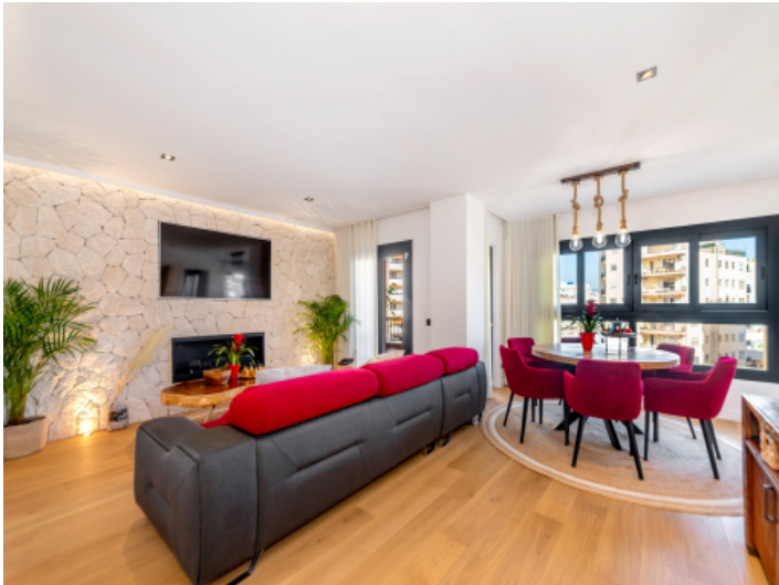
Stylish, modernised apartment with parking space in the