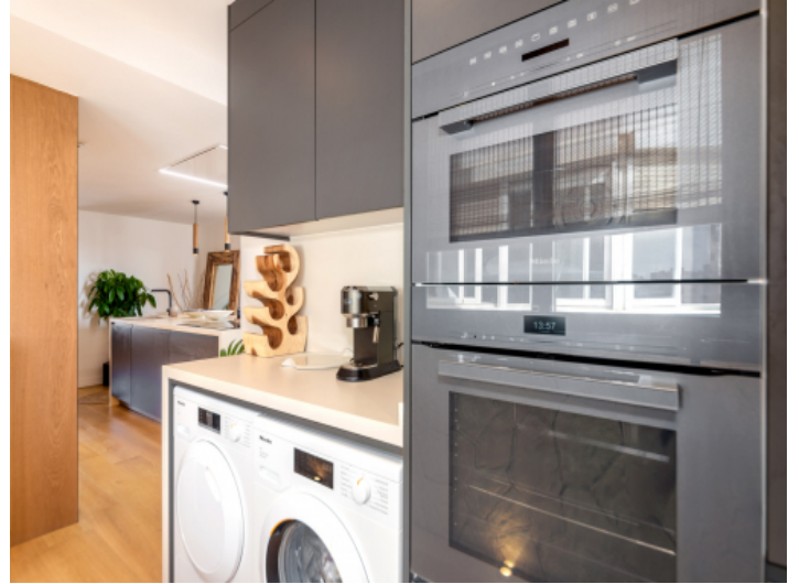
High quality appliance