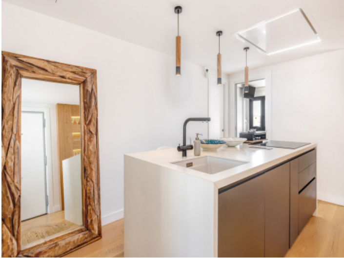
Large kitchen island