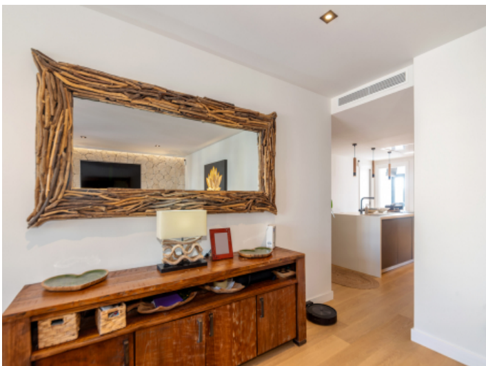
Ducted air conditioning