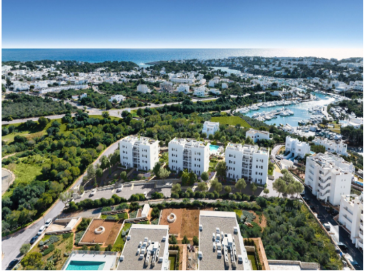
View from above