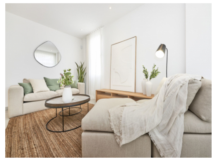
Light-flooded living area