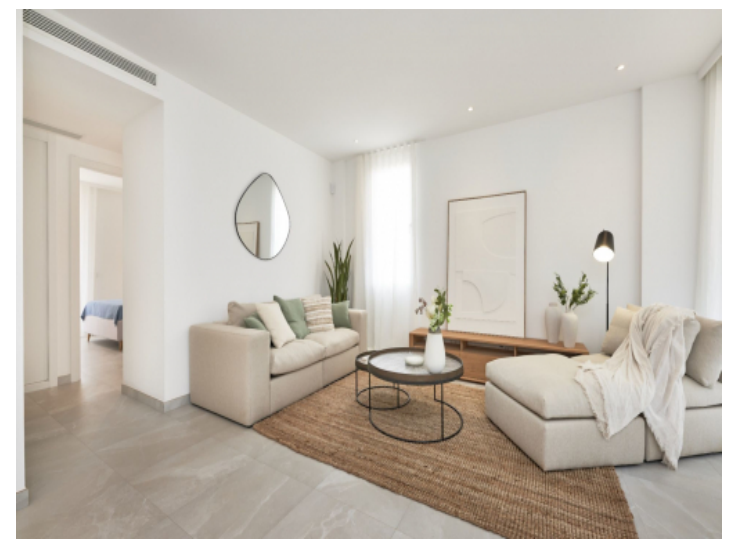
Another view of the living area