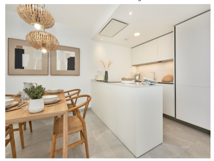
Modern, American kitchen