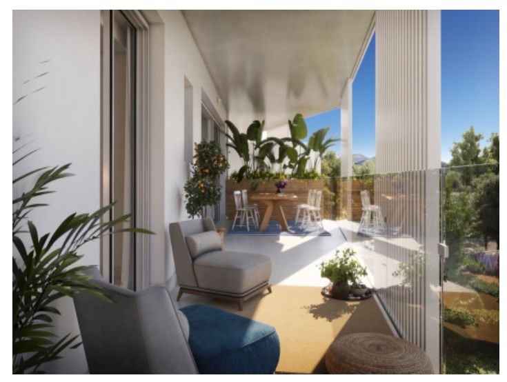
Beautiful covered terrace