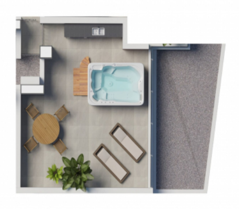
Floor plan of the roof terrace