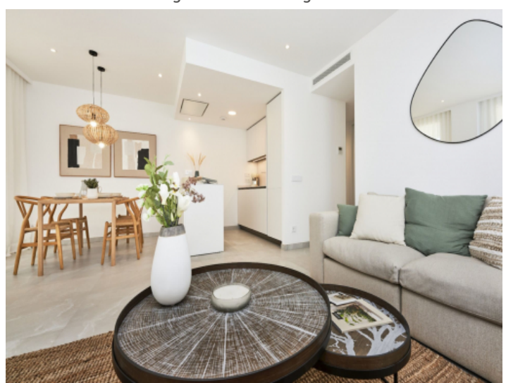
Open plan living and dining area