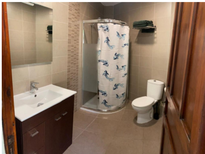
Flat with one bathroom