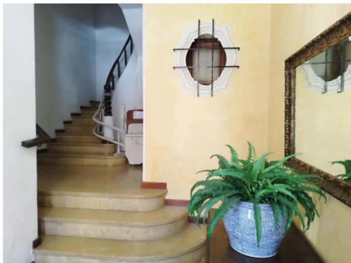
Entrance hall building