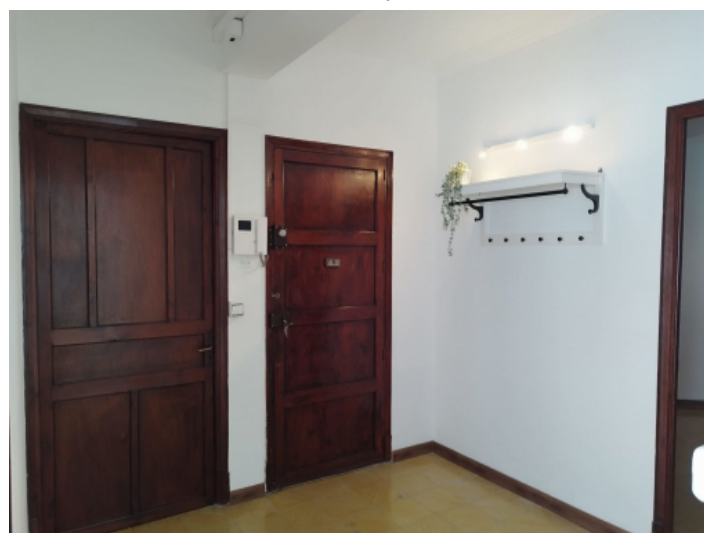
Entrance hall flat