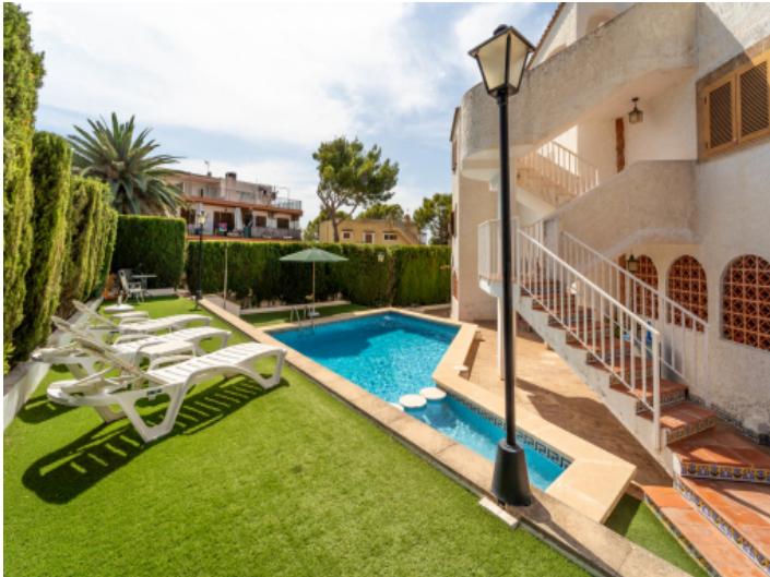
Garden and pool