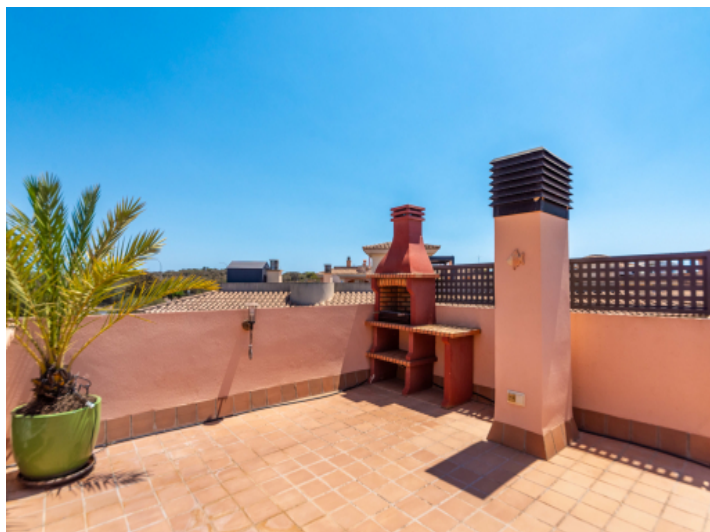
Rooftop terrace with BBQ