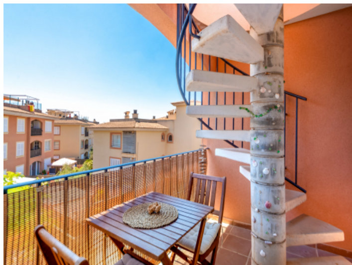
Balcony and access to the rooftop