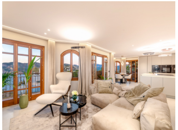
Open plan living and dining area