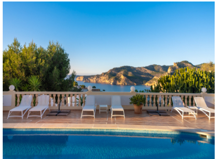
Pool area with mountain and sea views