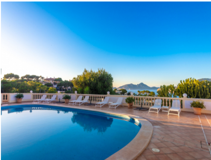
Superb community pool