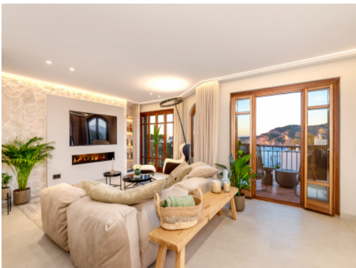
Living area with sea views