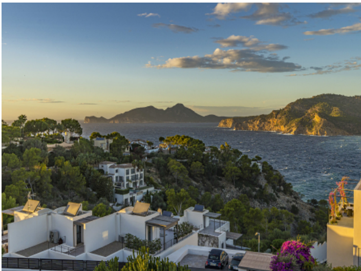
Breathtaking sea and mountain views