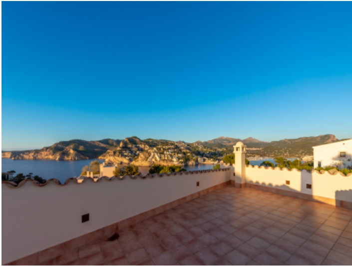
Roof terrace with panoramic views