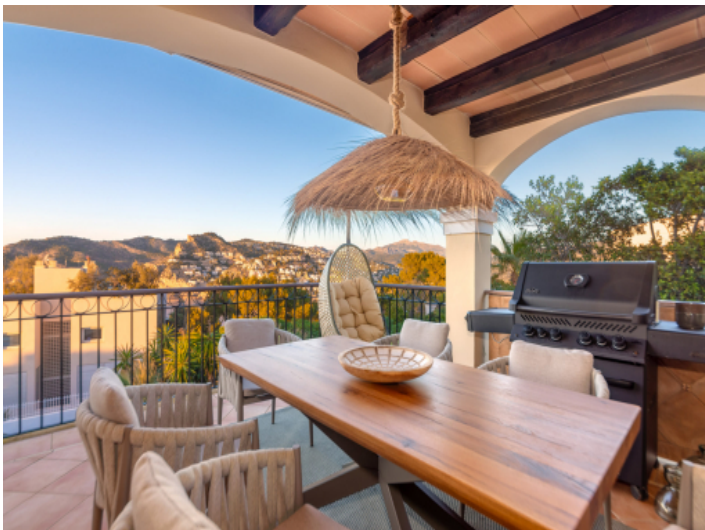
Covered terrace with breathtaking views