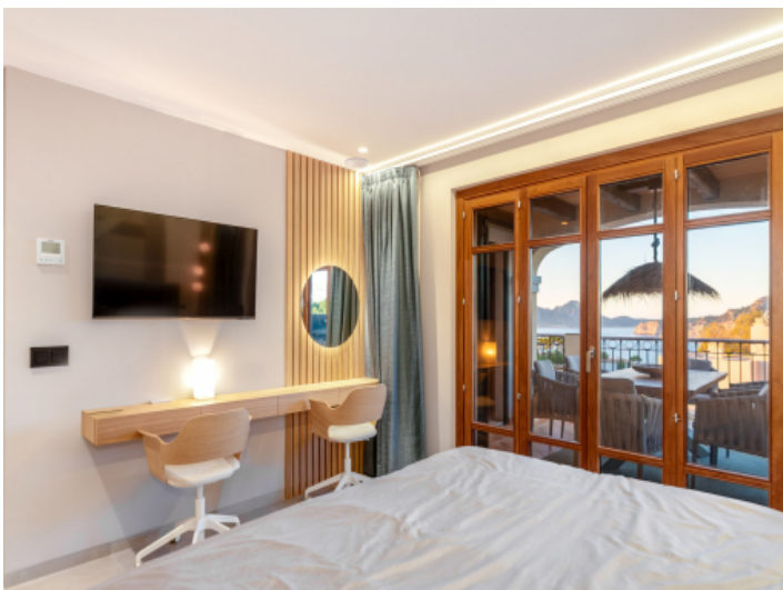
One of 2 bedroom