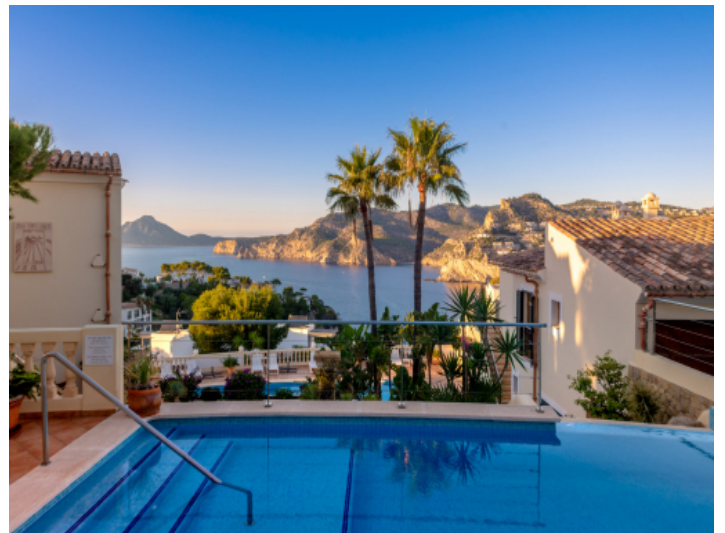
Magnificent sea views