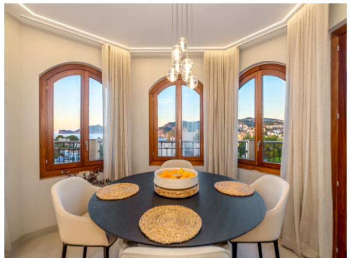
Elegant dining area