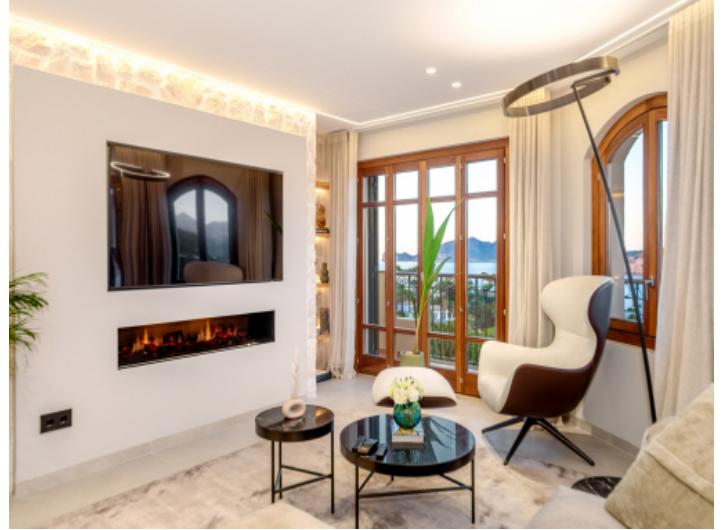
Cozy sitting area