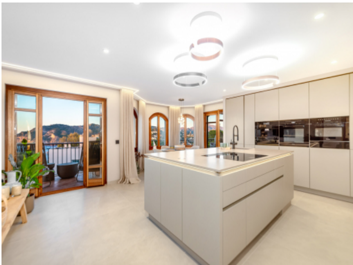
Fantastic kitchen with a view