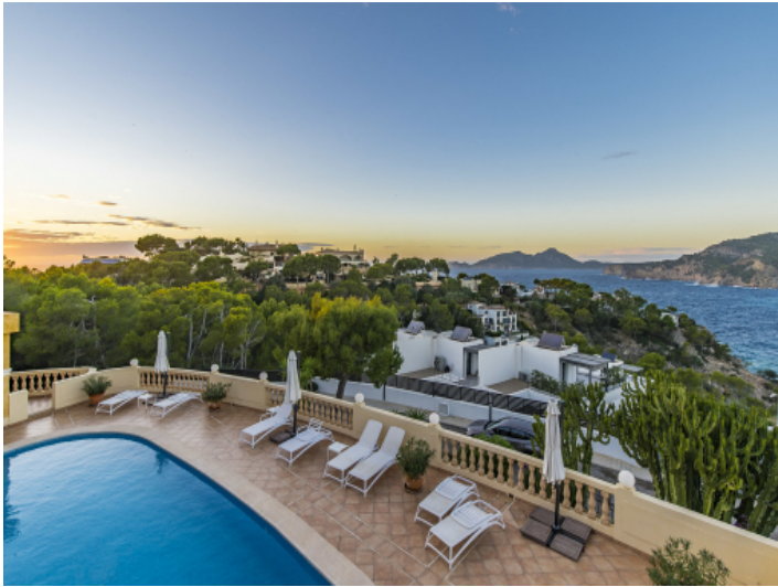
Pool area at sunset