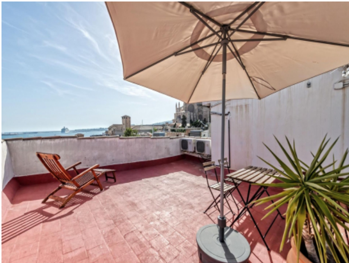
Community roof terrace