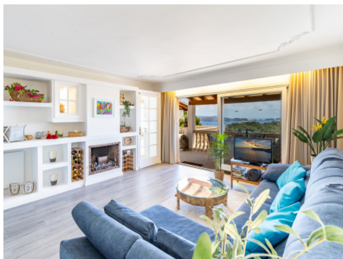
Sea views from the living area