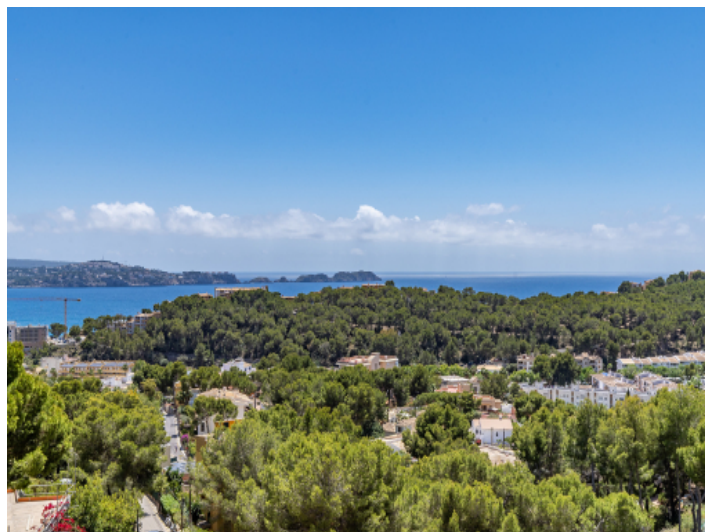
Mediterran sea views