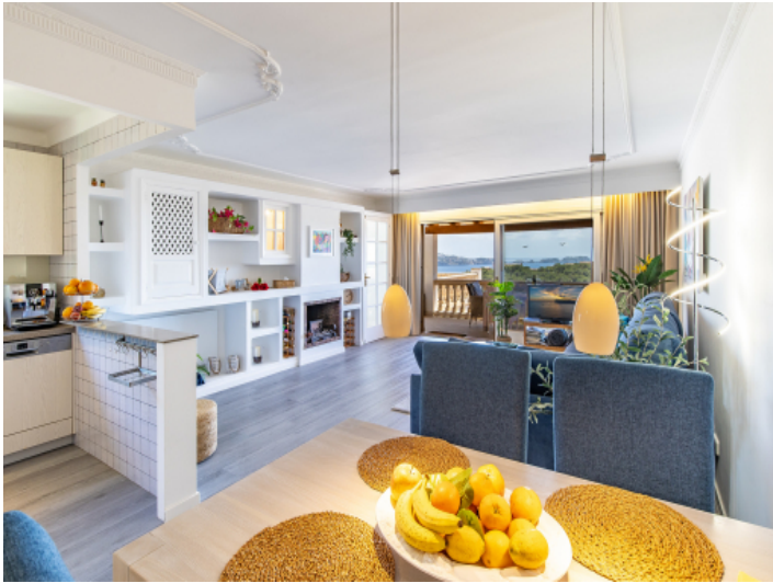
Open dining and living area