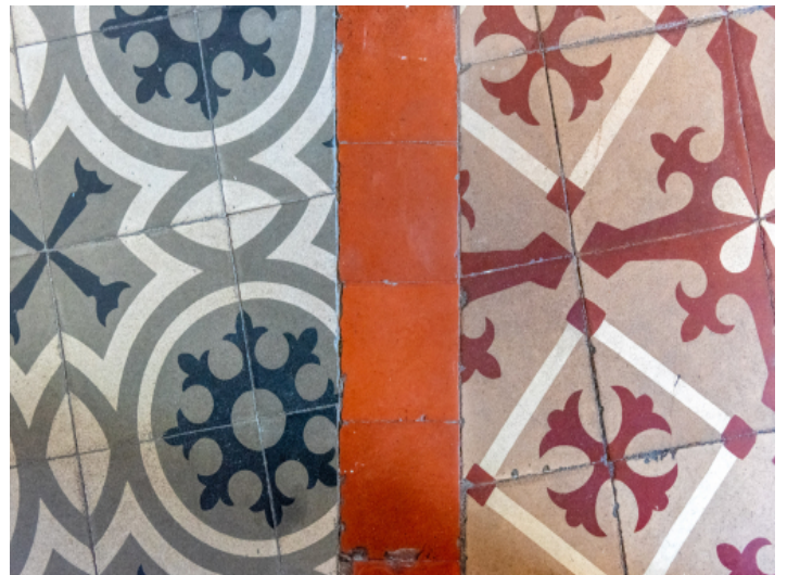
Original floor tiles