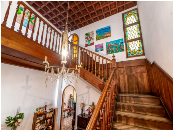
Impressive wooden staircase