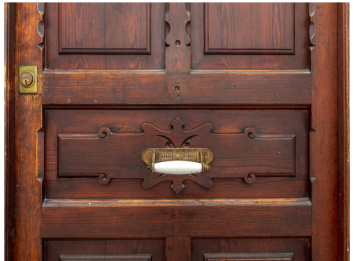
Original wooden doors