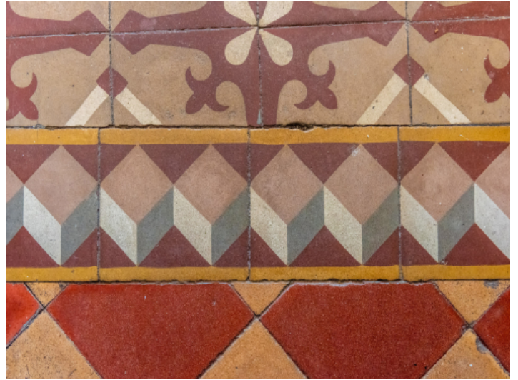
Original mallorcan floors