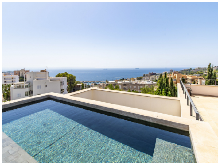
Pool with sea view