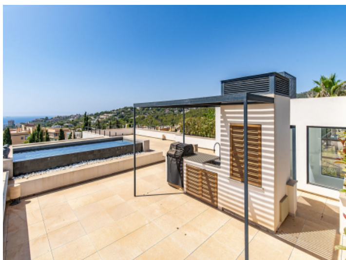
Large rooftop terrace with BBQ