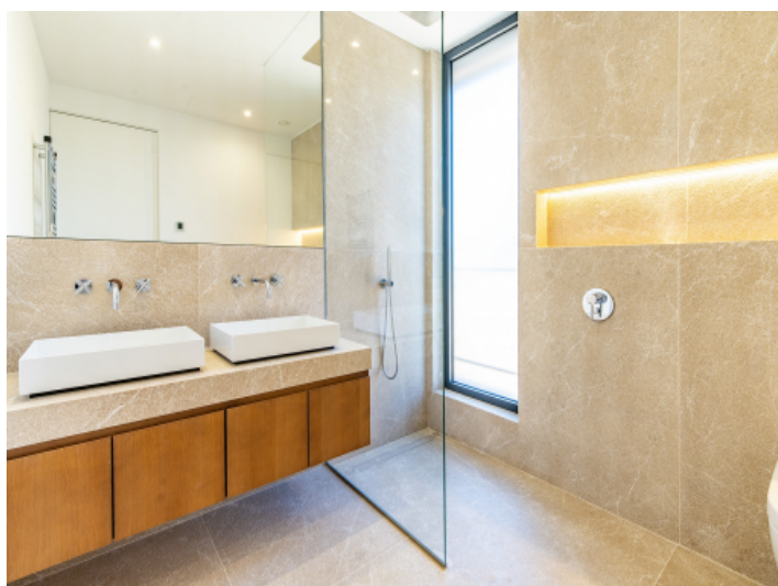
Penthouse with 2 bathrooms