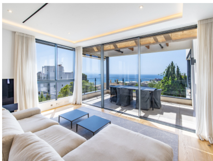
Stunning living area