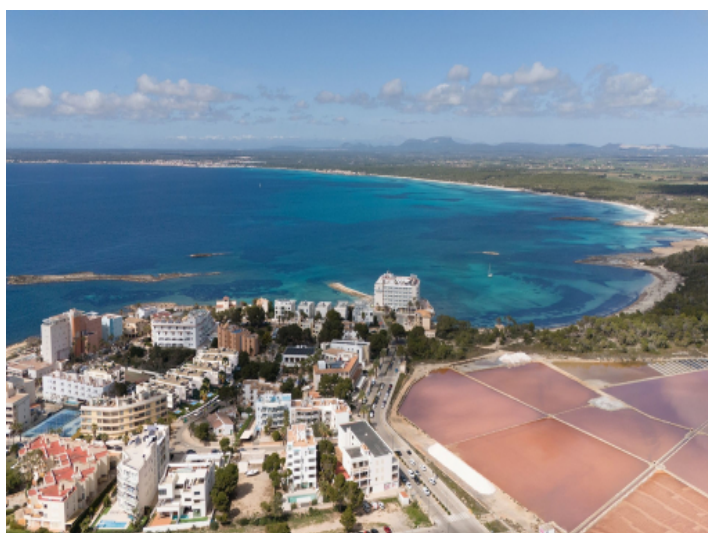
Colonia Sant Jordi