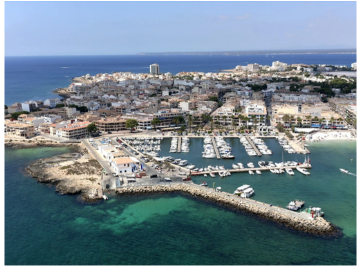
Harbour of Colonia Sant Jordi