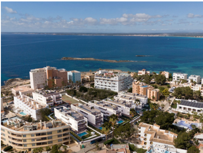
Nice village in the southeast