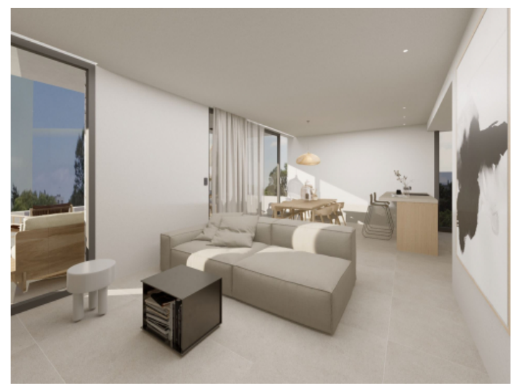
Pool Living area