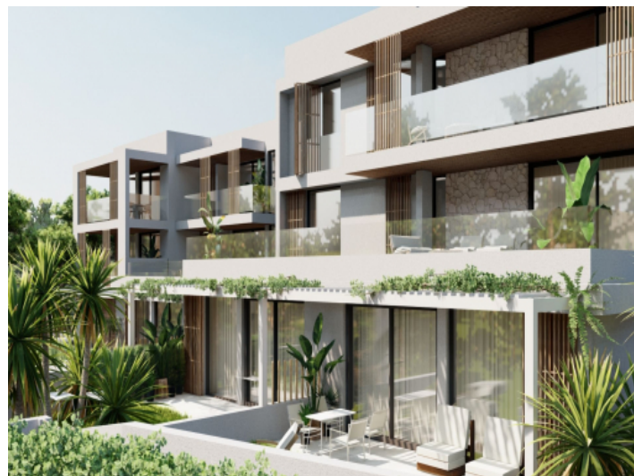
Ground floor apartment