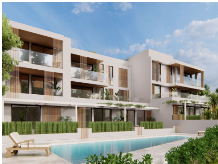
A fantastic new build ground floor flat in Porto Petro