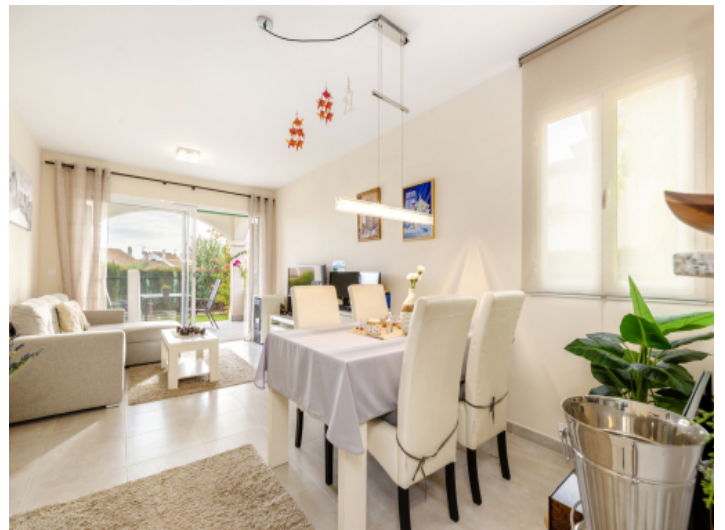
Modern living and dining area