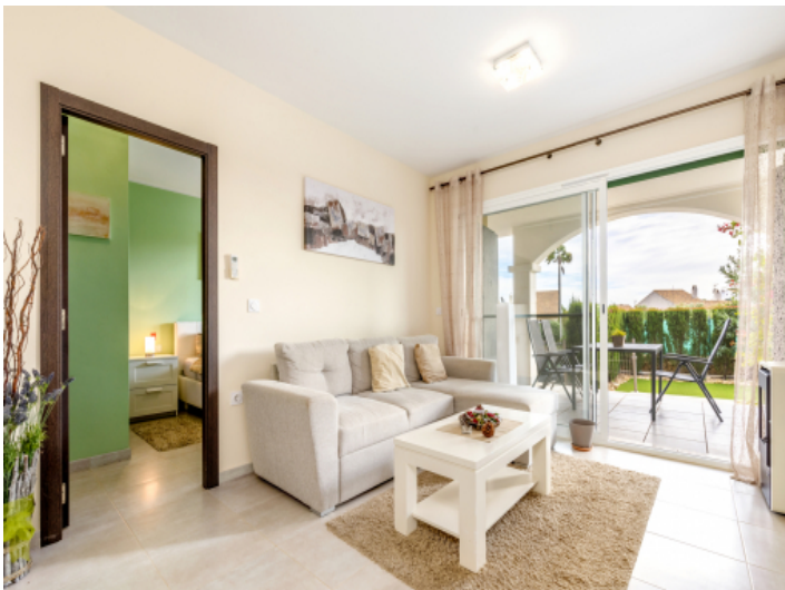
Lightflooded living area