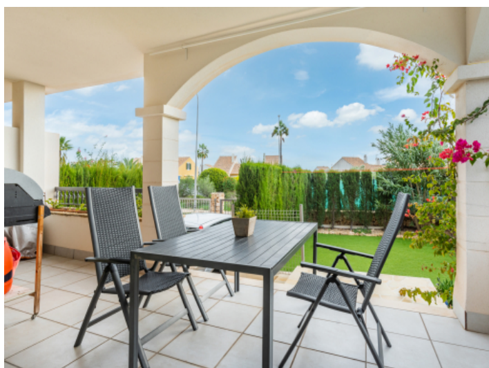
Terrace with garden views