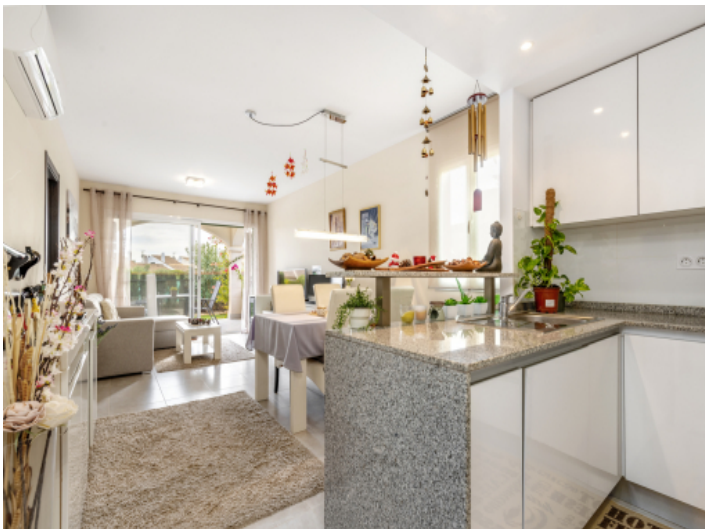
Adjoining, open kitchen