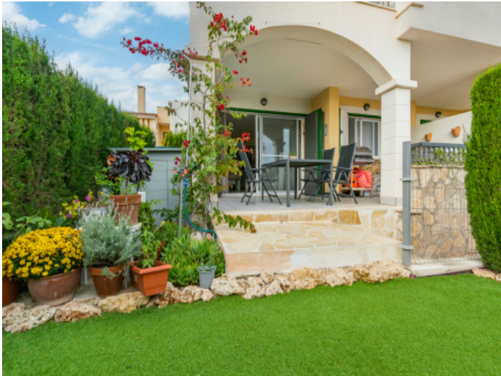
Lovely terrace and garden area