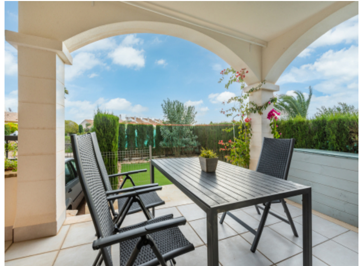
Covered outdoor dining area