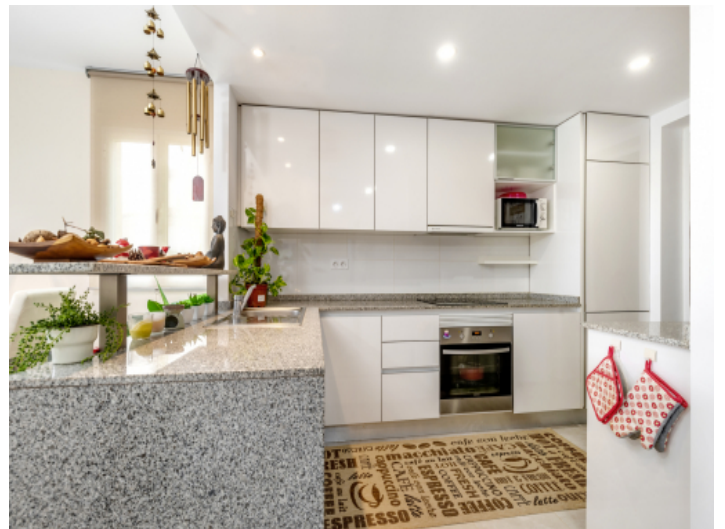
Modern fully equipped kitchen