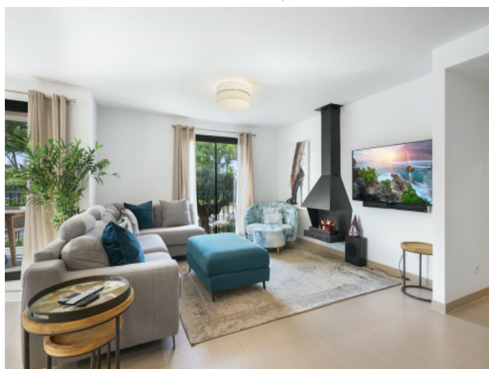
Bright living area with fireplace