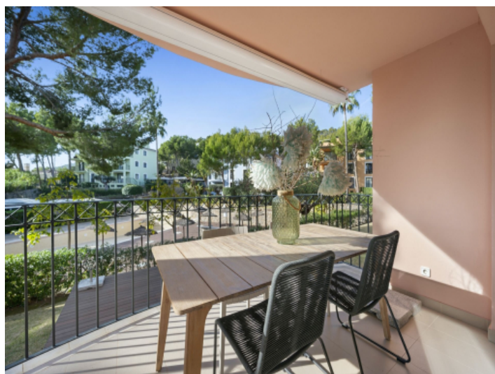
Nice views to the pool area