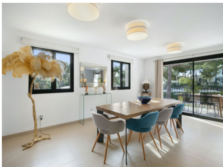
Beautiful dining area