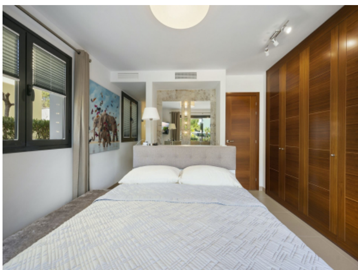
All bedrooms with fitted wardrobes