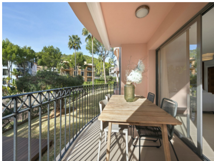
Views from the terrace