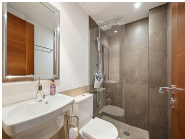
Bathroom with walk in shower