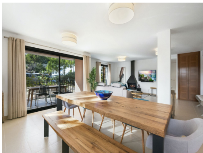
Open plan design