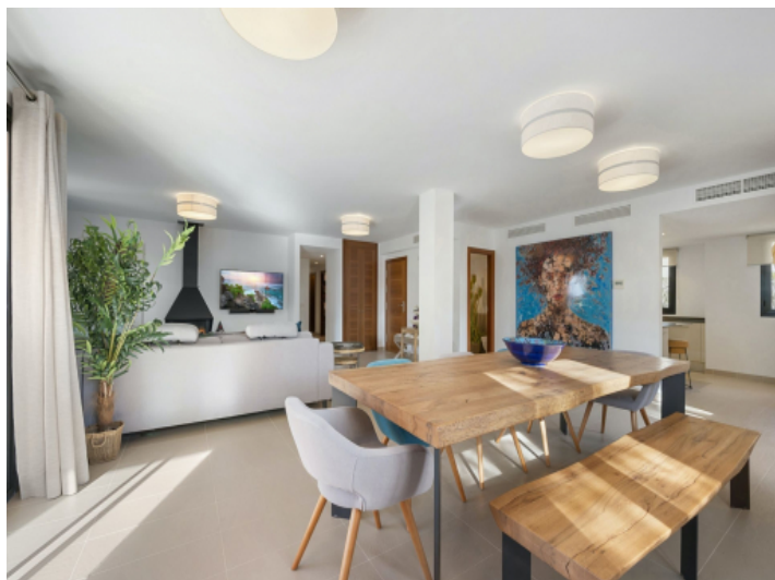
Cozy and modern lifestyle