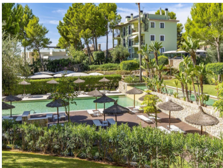
Great community area