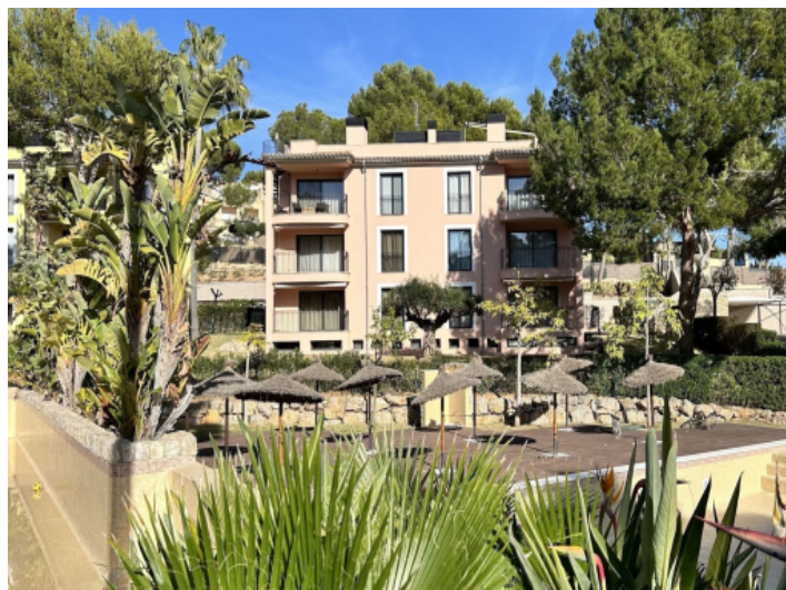
Facade and garden area