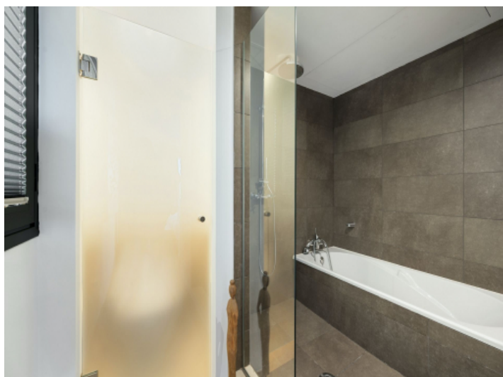
Bathroom with separate toilet