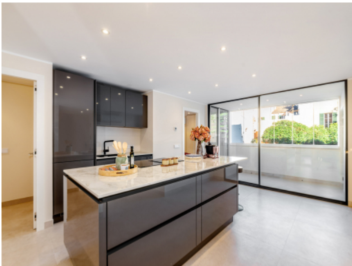
Kitchen with balcony access