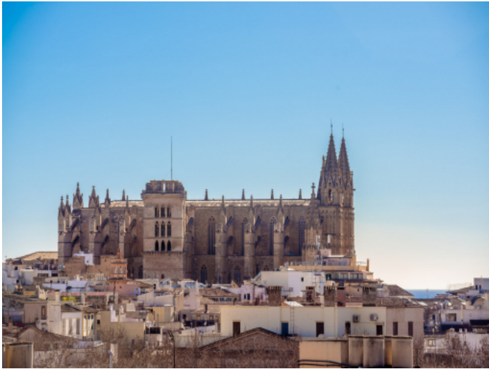
View of the cathedral