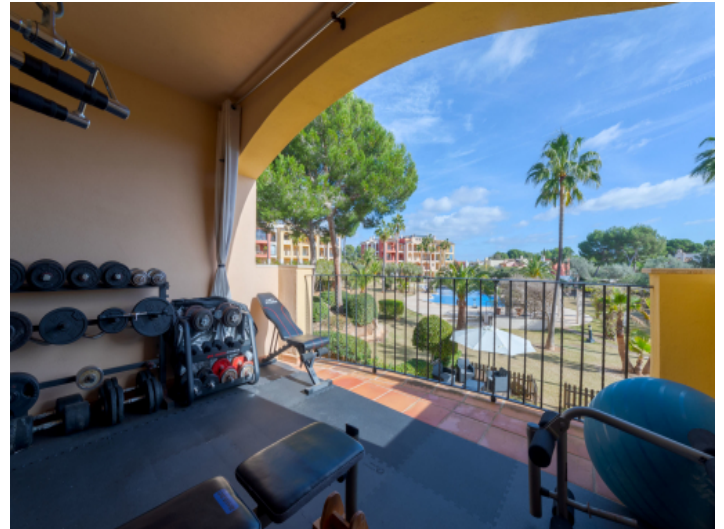
Covered terrace overlooking the community garden and pool