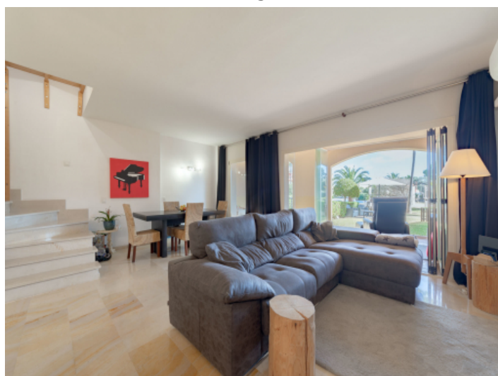
Spacious living and dining area