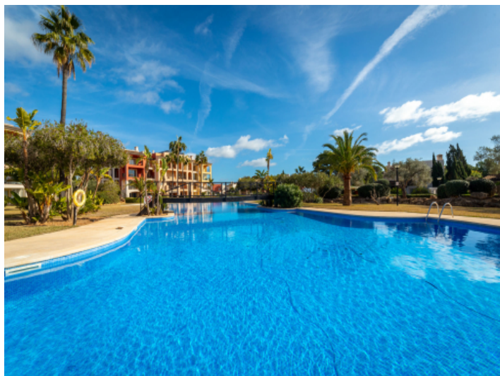
Large community pool