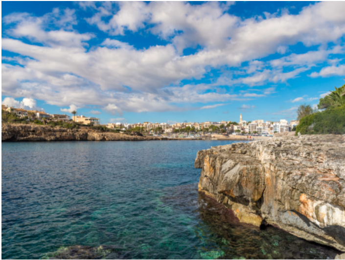
Close to the the harbour of Porto Cristo