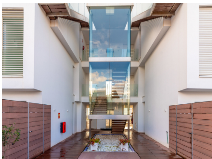
Entrance to the exclusive community