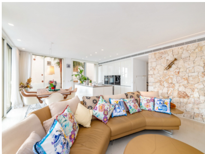
Natural stone wall give the apartment the mediterranean