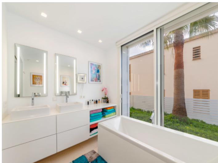
Double washbasin and bathtub