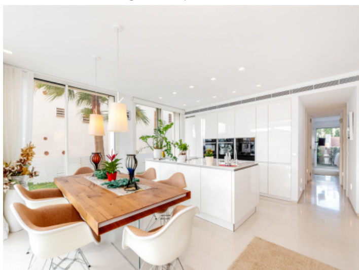
Open plan kitchen