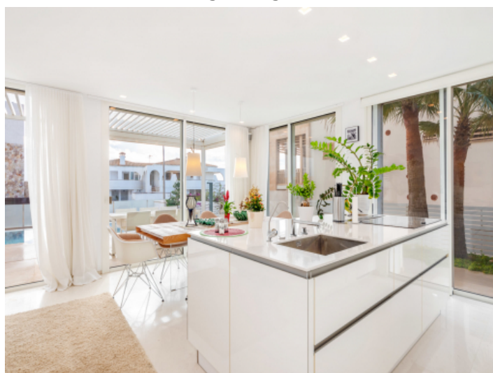
Comfortable kitchen island