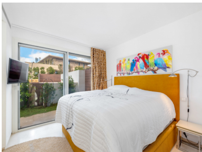
Large bedroom with bath en suite