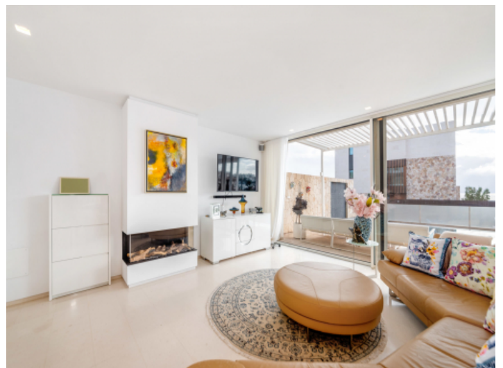
Integrates gas fireplace