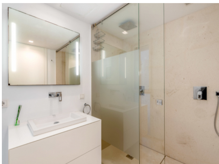
Modern bathroom with shower