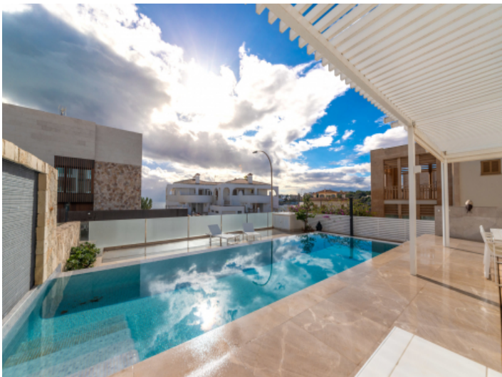
Porch with views