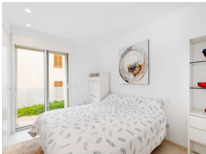
2nd sunny bedroom