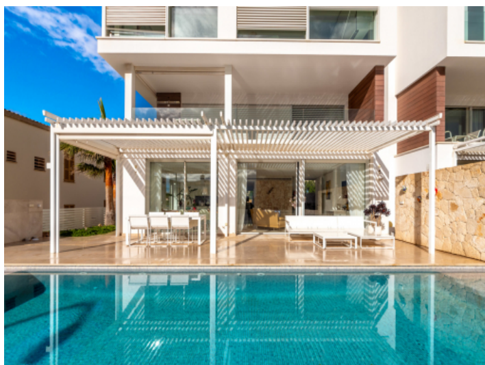
Small community with only 5 units