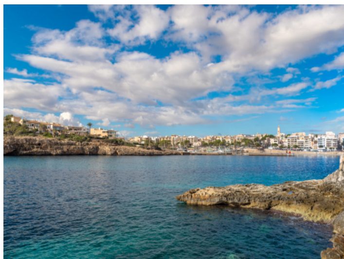
Porto Cristo harbour and beach