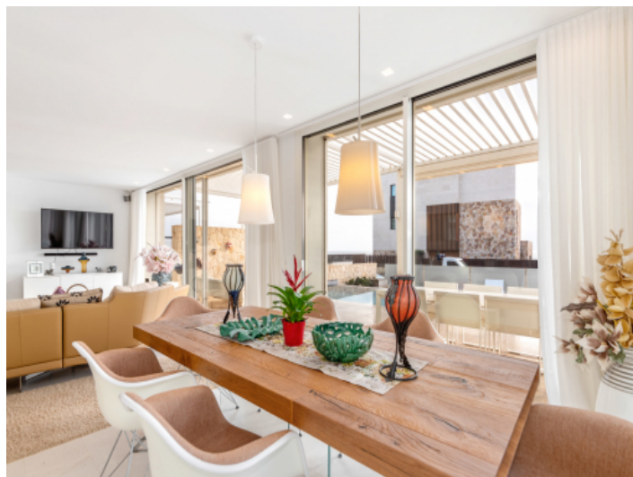
Large dining area