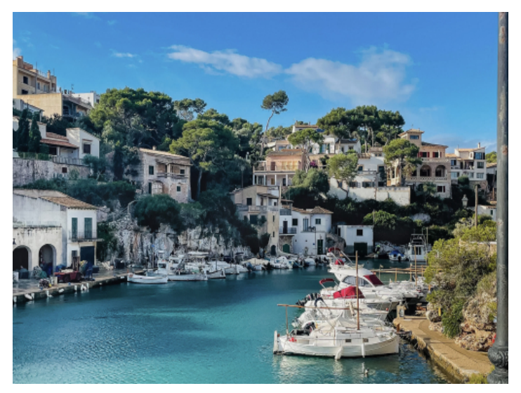
Port of Cala Figuera