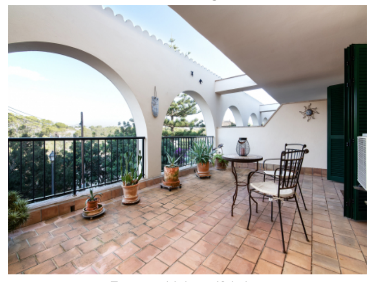
Terrace with beautiful view