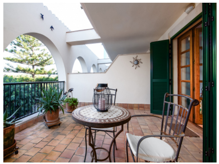
Large, roofed terrace