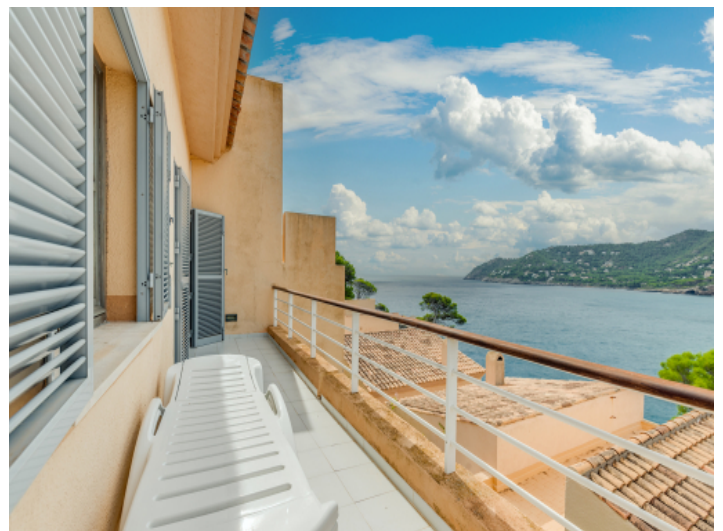
Views from the balcony to the surroundings