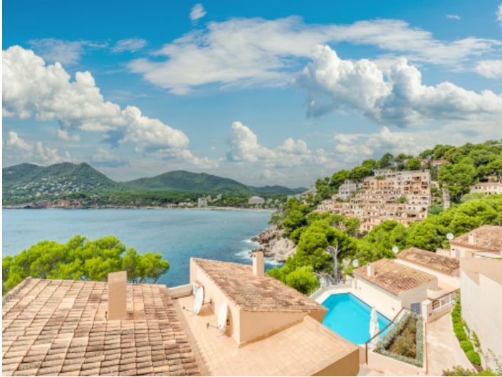
Views to the neighbourhood