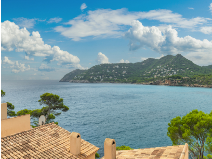
Mediterran sea views from the balcony