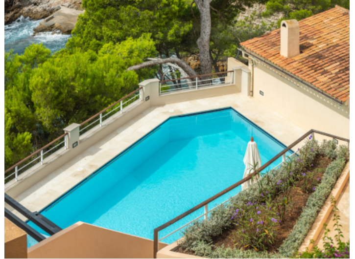
Pool views from the balcony