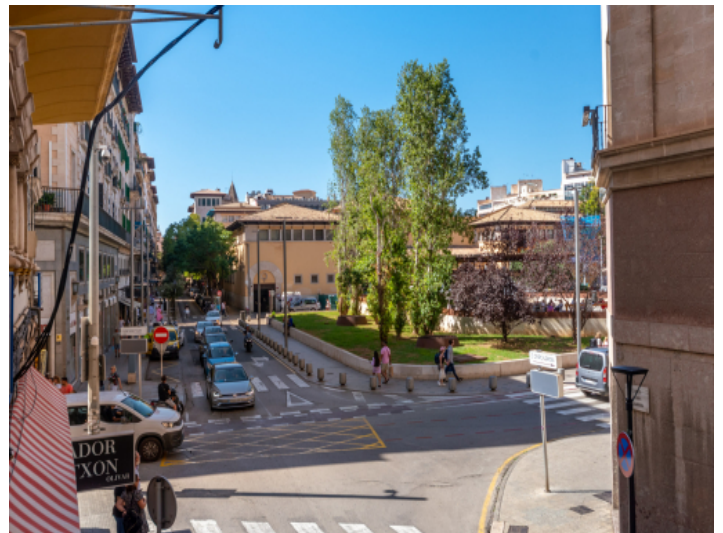
View out of the window