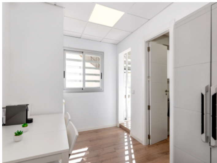
Access to the terrace