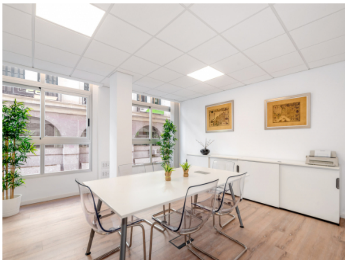
Plenty of light