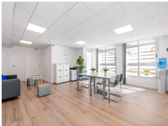
Spacious living space