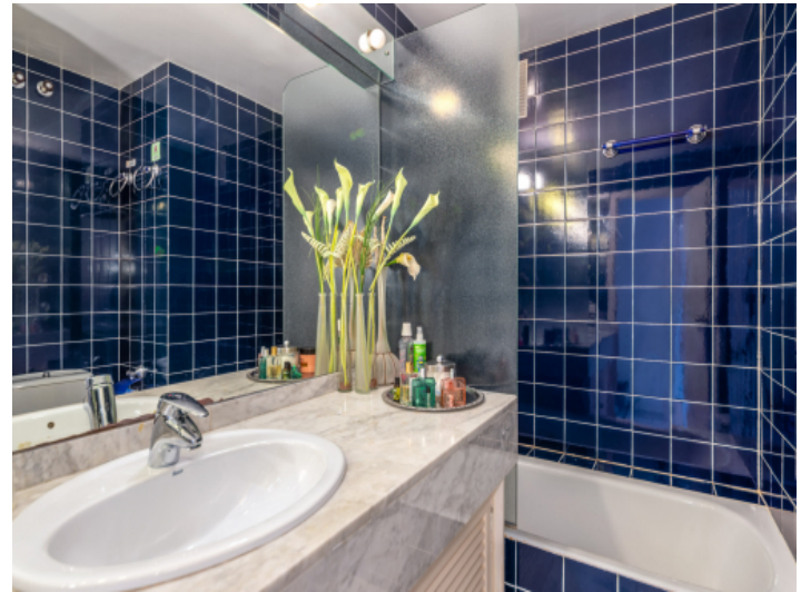
Bathroom with bathtub