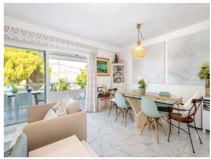
Bright living and dining area