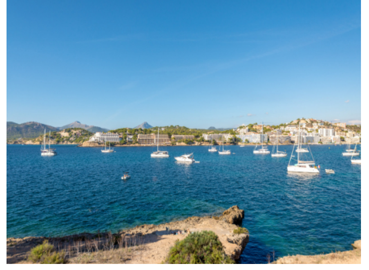
Wonderful sea views