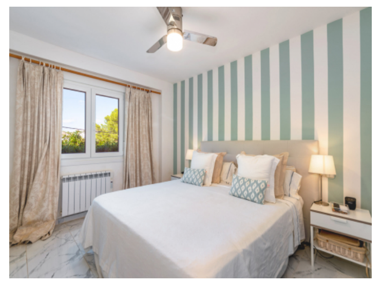
Cosy double bedroom