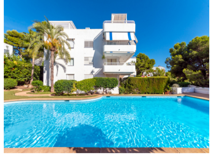
Beautiful communal pool