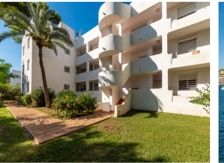
View of the building