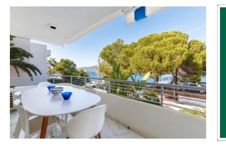
Santa Ponsa search for property MAL-120730