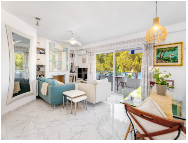
Living area with balcony access