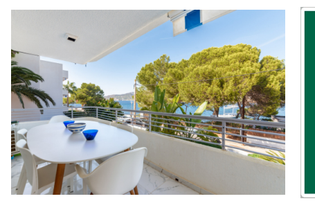
Santa Ponsa search for property MAL-120730