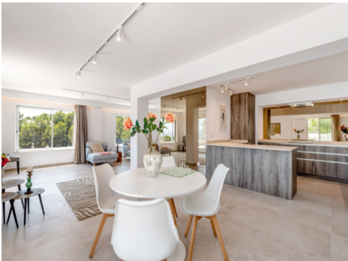
Modern, open-plan living area