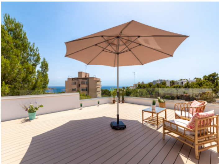
Fantastic views to the sea