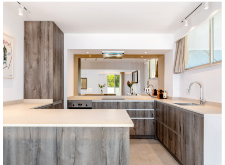
Fully equipped high quality kitchen