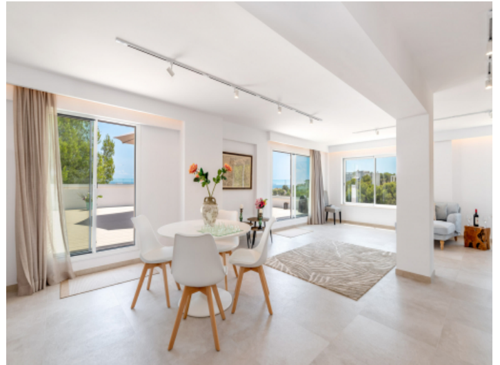
Terrace access from the dining area