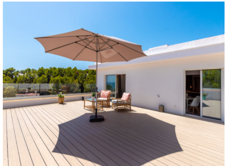
Large 80 sqm roof terrace