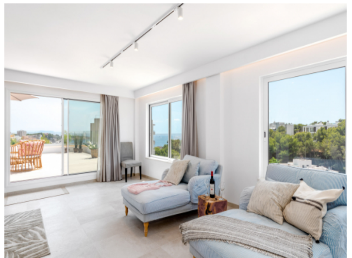
Terrace access from the living area