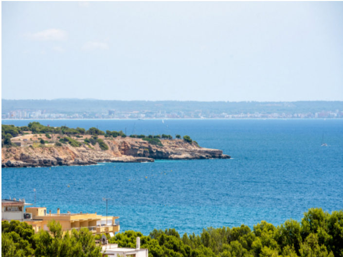
Beautiful sea views