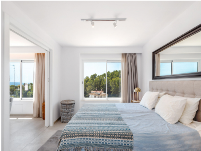
Beautiful double bedroom