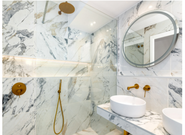
Elegant shower bathroom