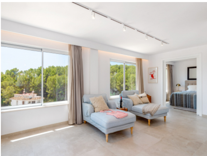
Access to one bedroom