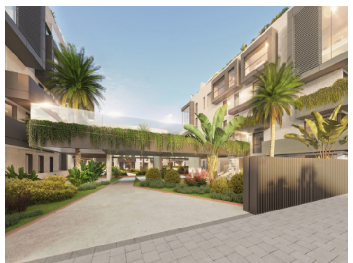
Access to the complex