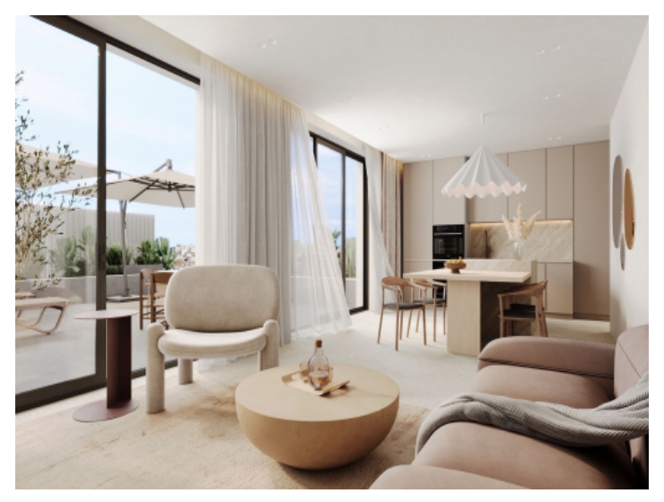
Living and dining area with access to a terrace