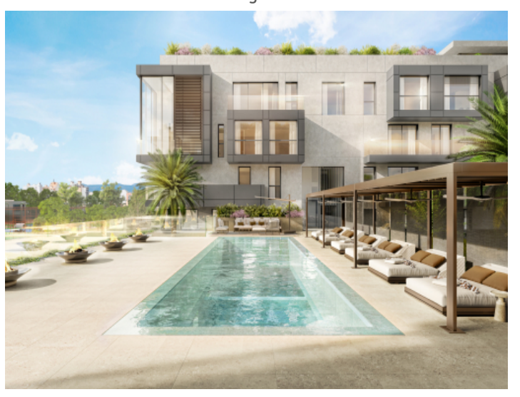
Alternative view of the pool