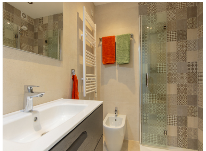
Modern shower bathroom