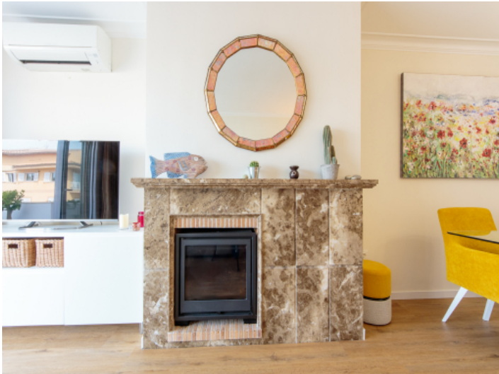
Cosy fireplace for winter days