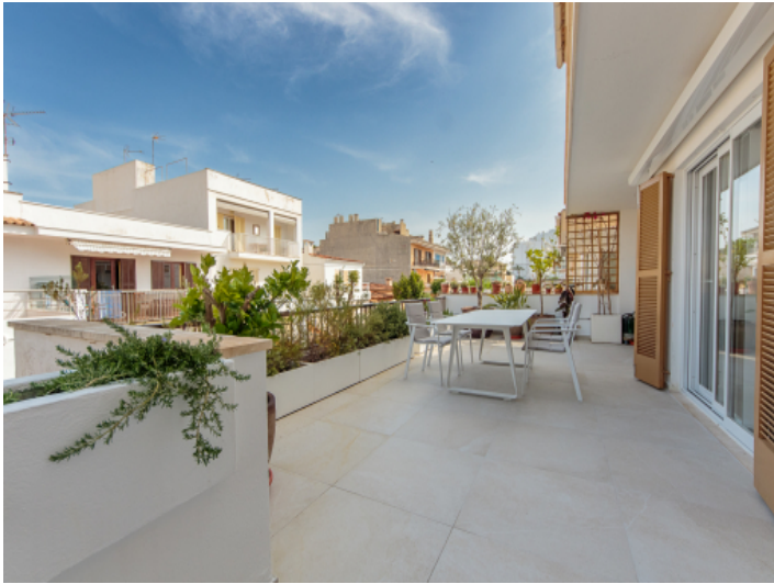
Fanstastic large tarrce