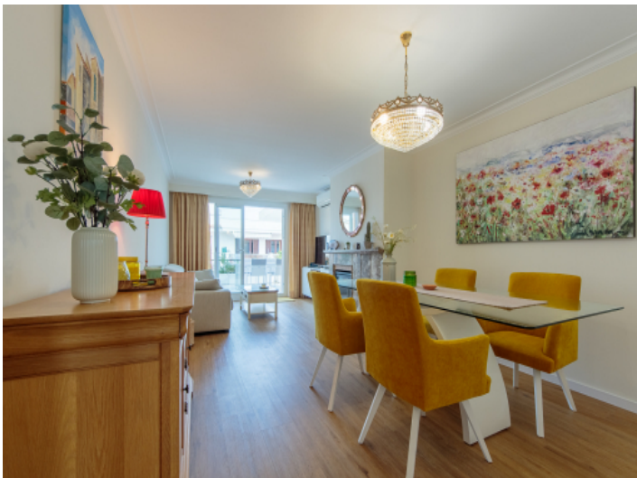
Tastefully decorated living and dining area