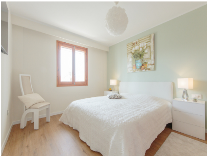
Comfortable double bedroom