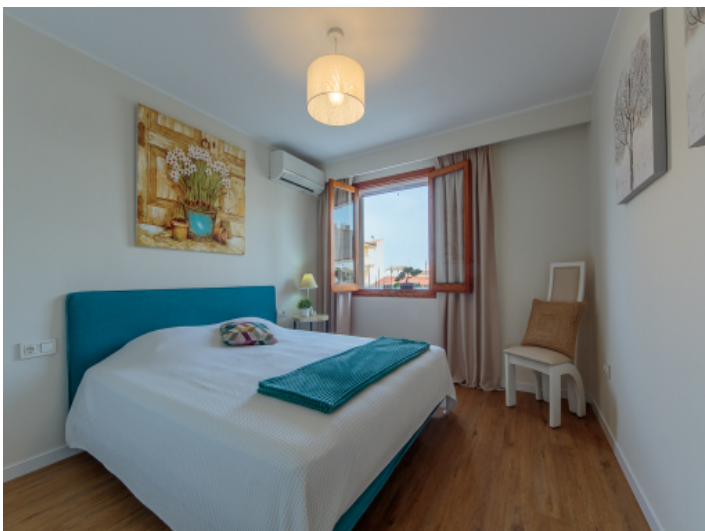
Bedroom with air conditioning and heating