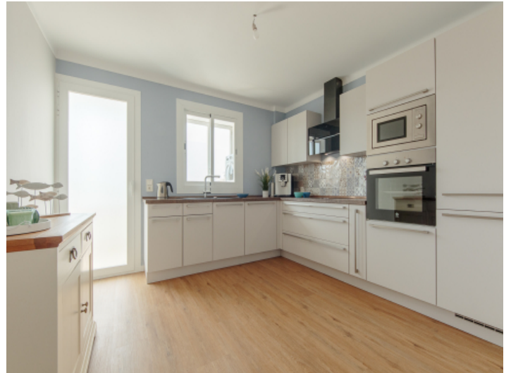
Modern, spacious kitchen