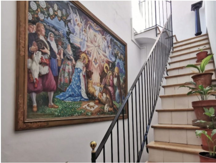
Stairs leading up to the communal terrace