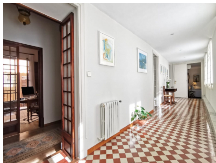
Sunny, spacious flat in Palma with a special Mallorcan character