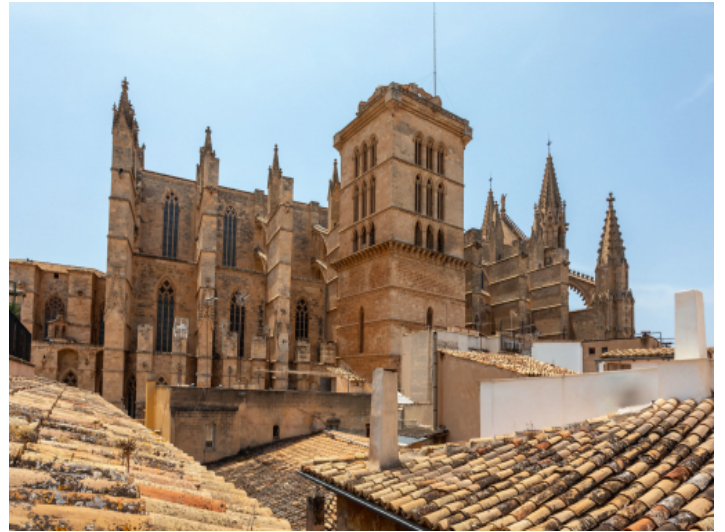
Fantastic view to the cathedral