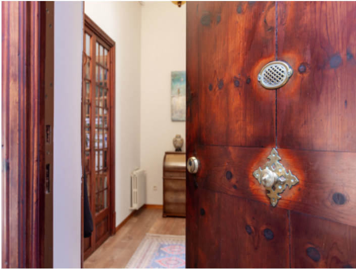
Entrance with lots of character