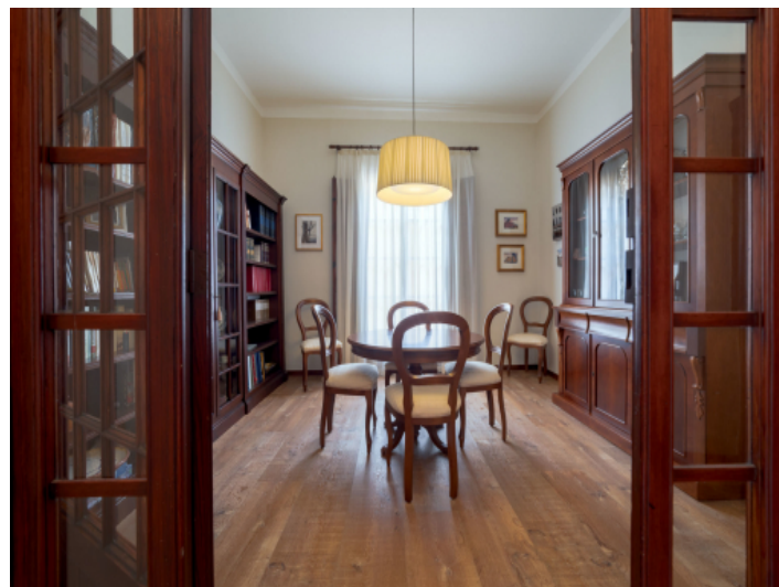
Classic dining area