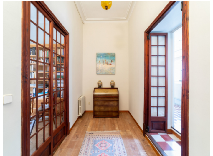
Beautiful entrance area