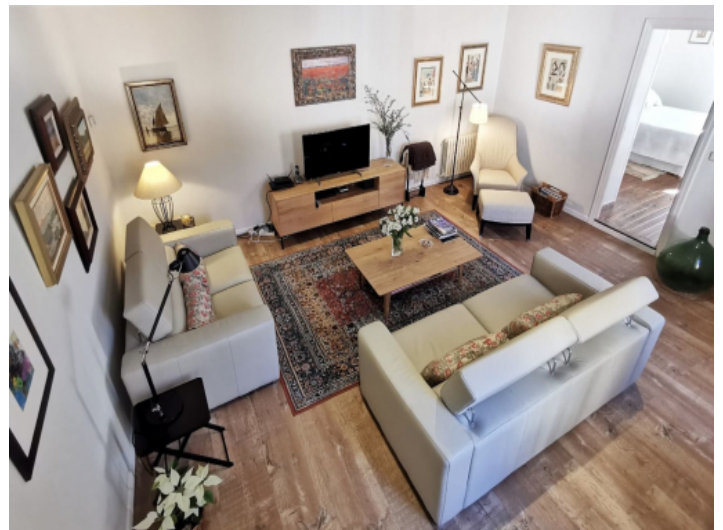
Cosy living area