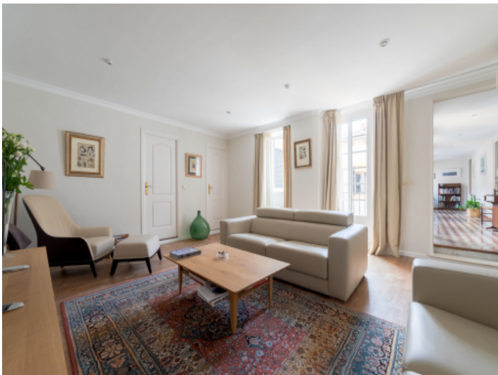
Elegant living area