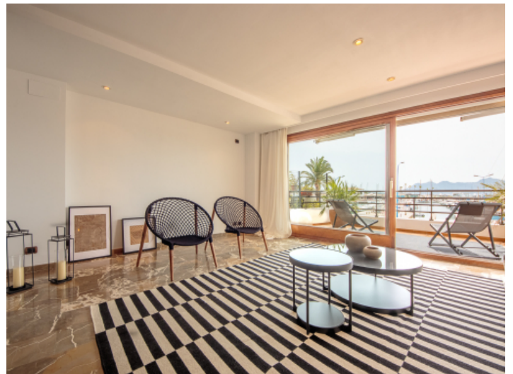
Living area with access to the terrace