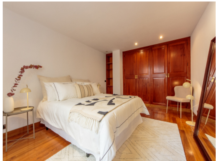
Bedroom with built-in cupboards