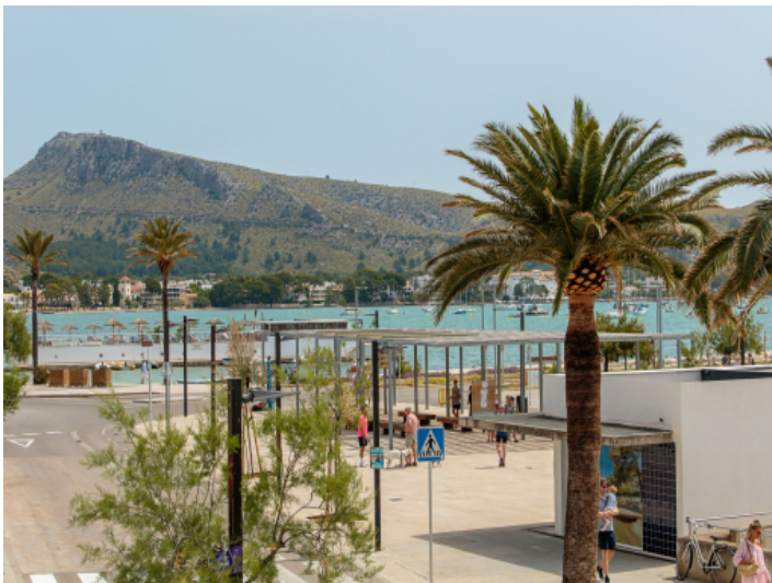
Sea and mountain views