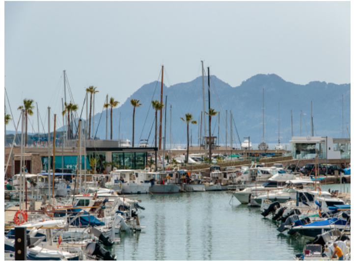
Beautiful harbour view