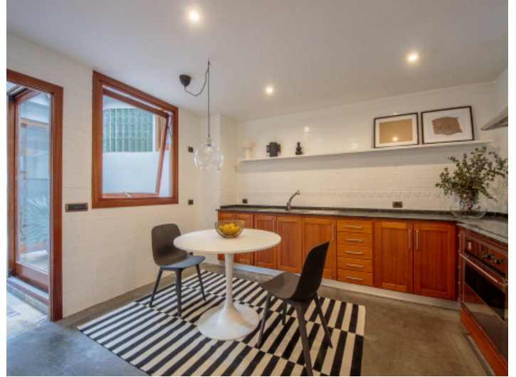
Fully equipped live-in kitchen