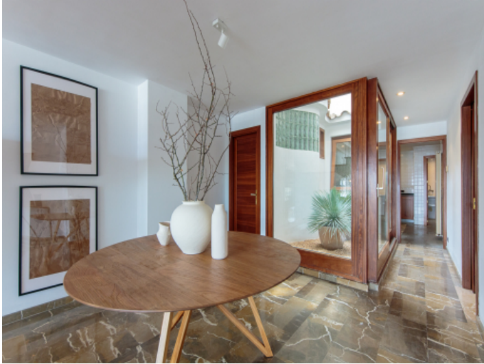
Elegant dining area