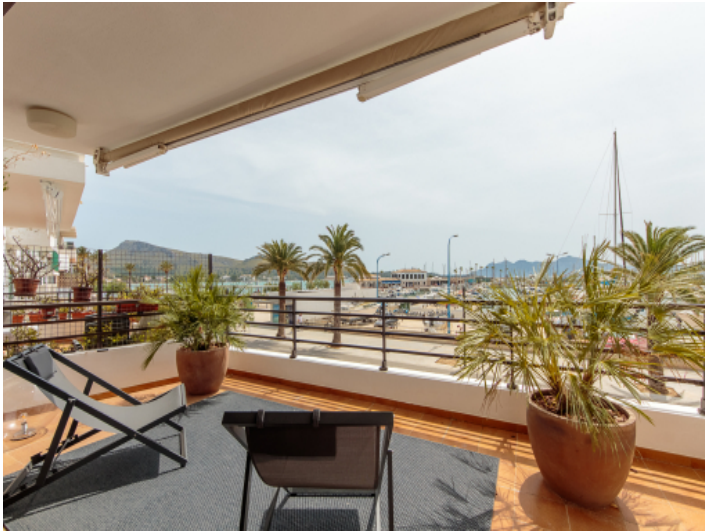
Large terrace with a harbour view