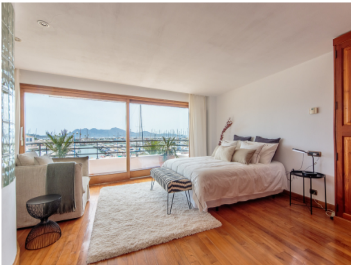
Spacious bedroom with fantastic views