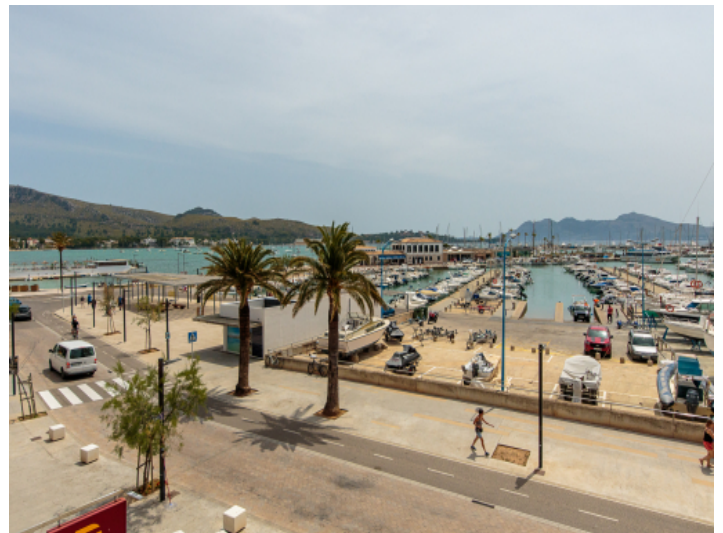
Impressive sea and mountain views