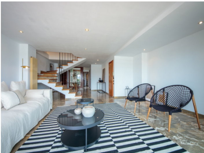
Large living area