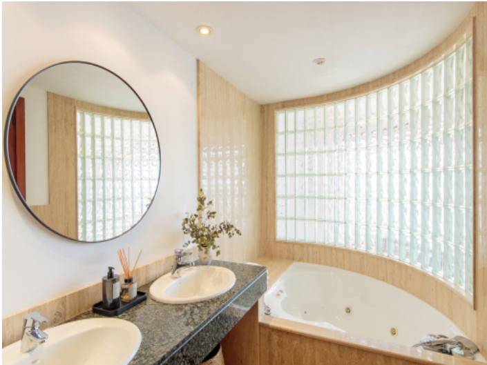
Bright bathroom with bathtub