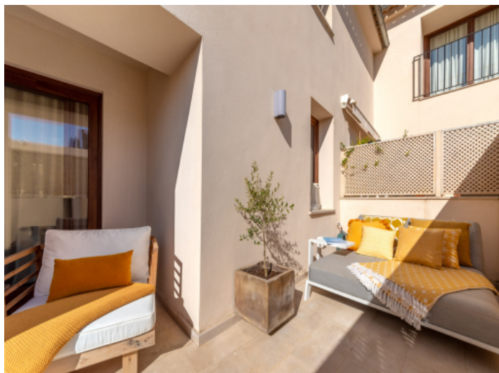
Sunny terrace with seating