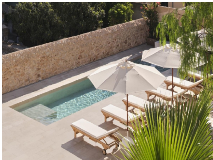
Lovely community pool