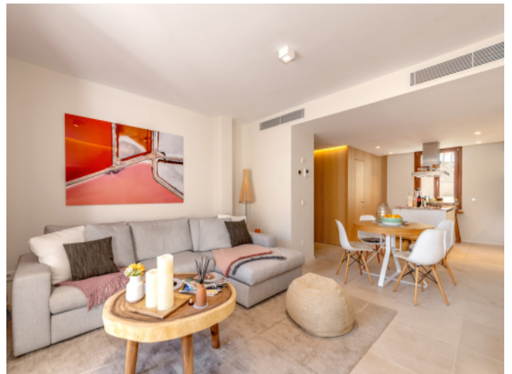
Open plan living and dining room