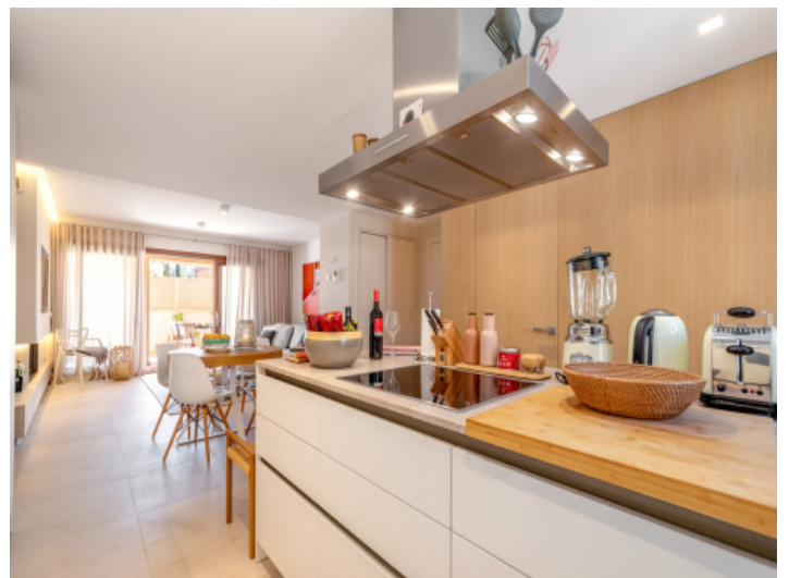
Kitchen with island