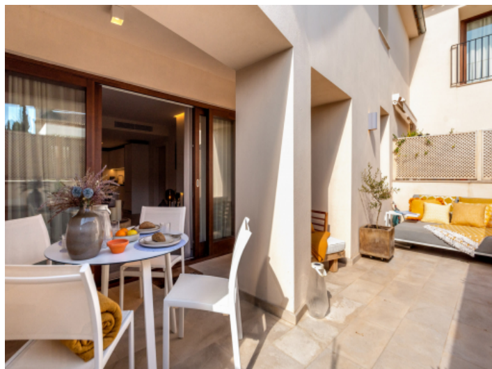
Partially covered terrace