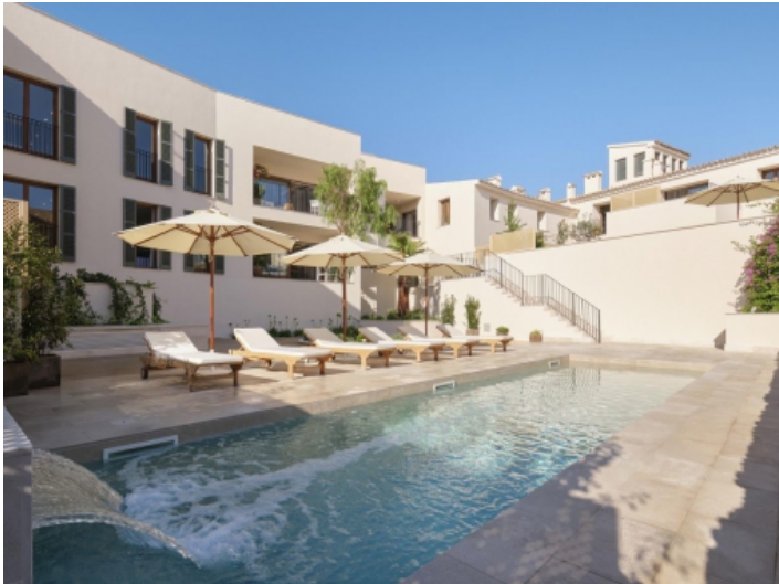
Lovely community pool area