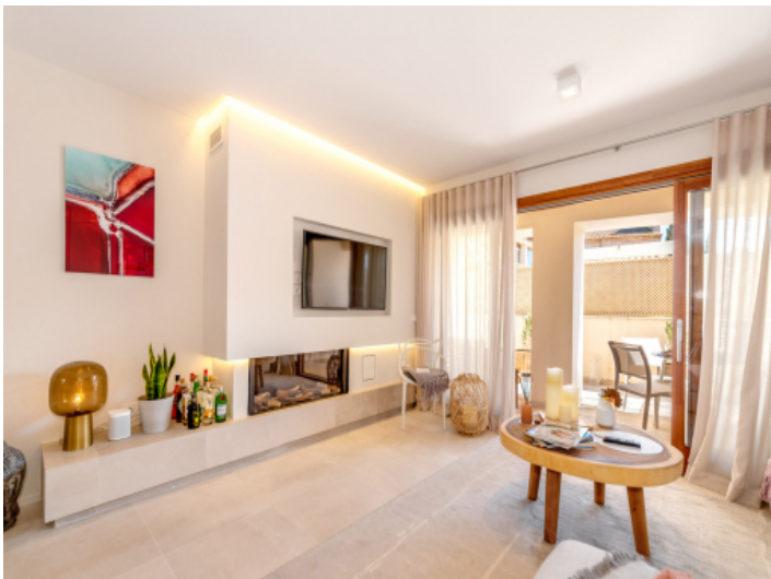
Cozy fireplace in the living room