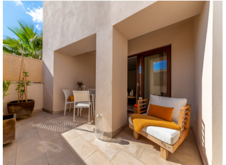
Private terrace with lounge area