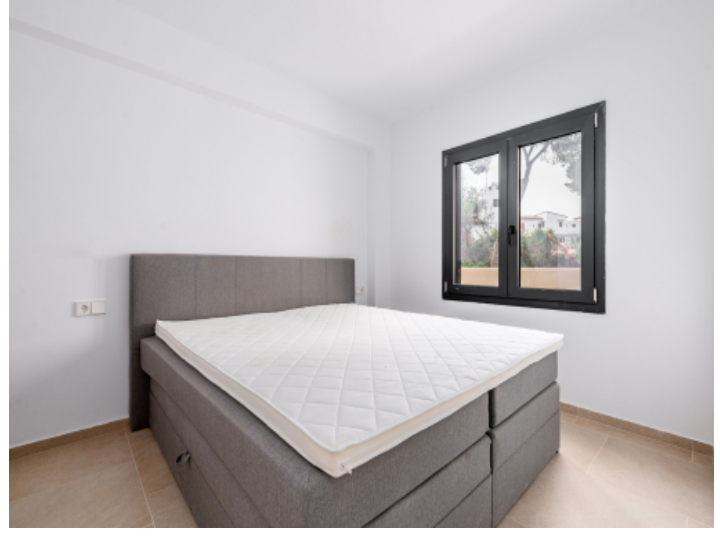
Bright double bedroom