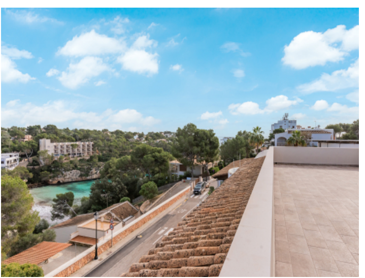
Large roof top terrace