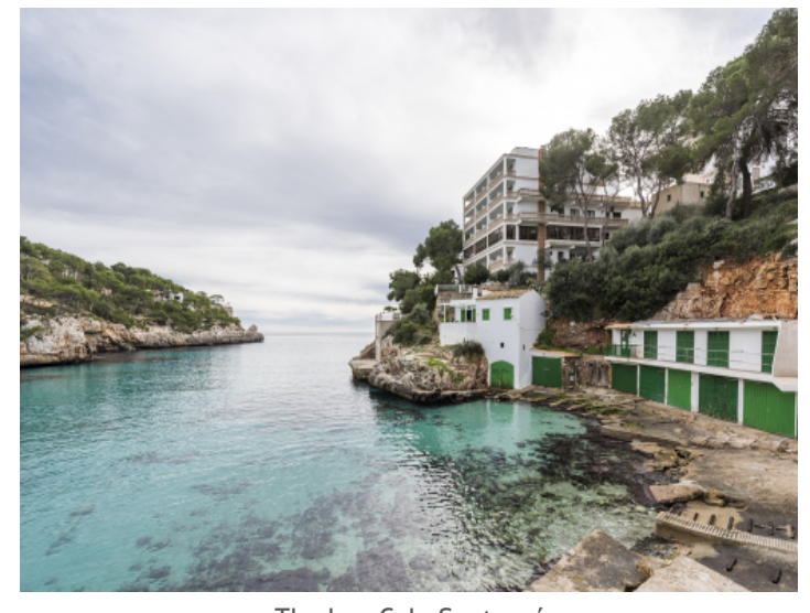
The bay Cala Santanyí