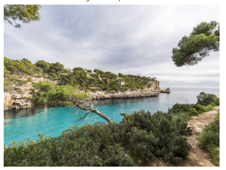
View to the sea