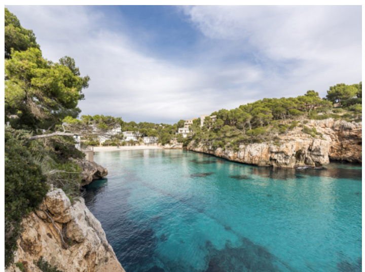
Cristal clear water in the Cala Santanyi