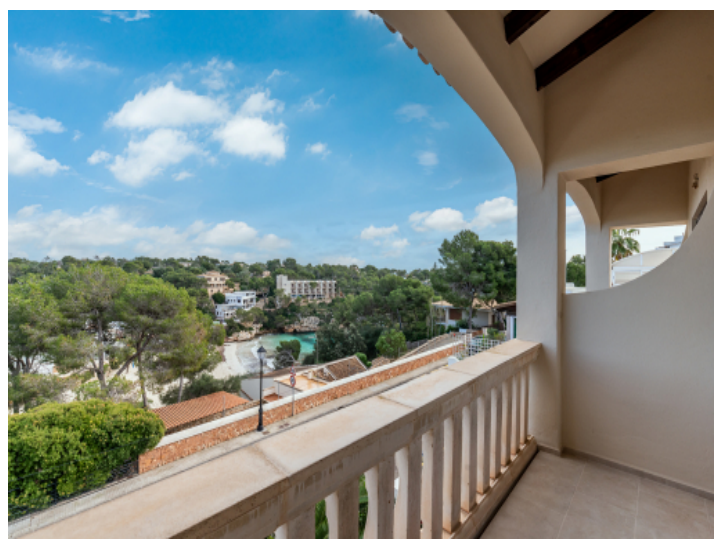
Views from the balcony