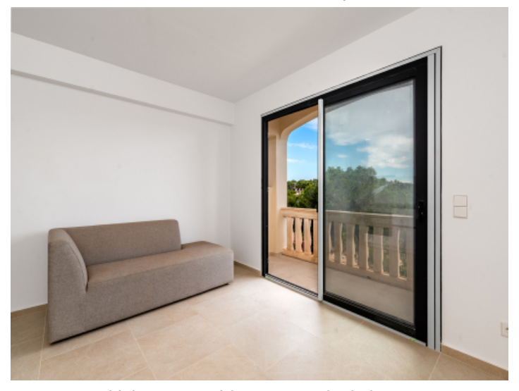
Living room with access to the balcony