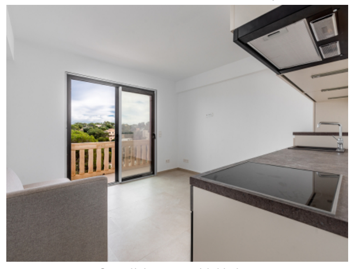
Open living area with kitchen