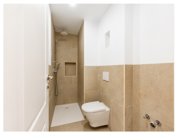
Noble bathroom with walk-in shower