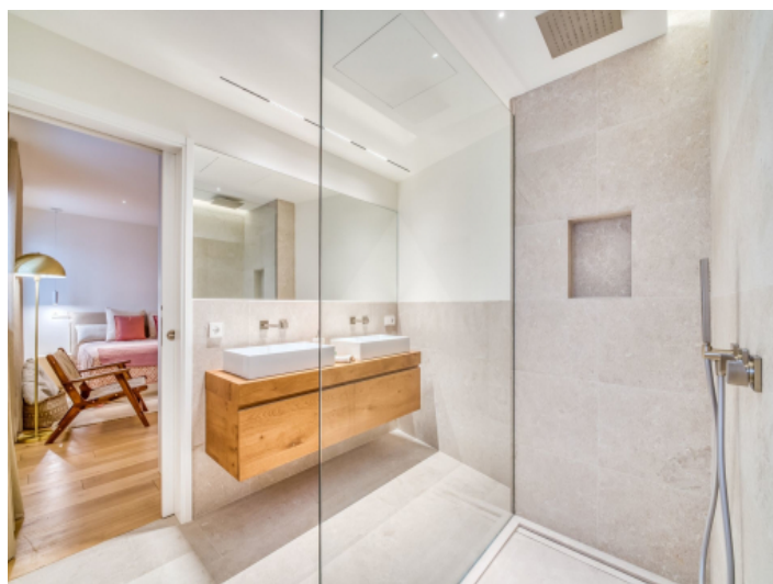
Bathroom with walk - in shower