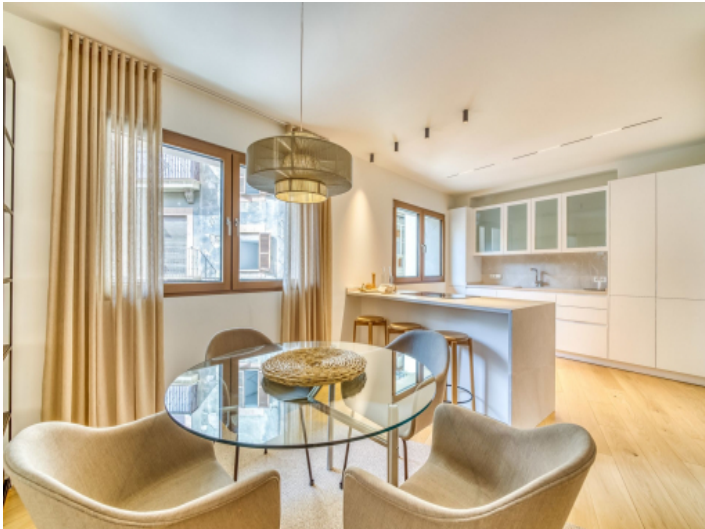
Elegant dining area