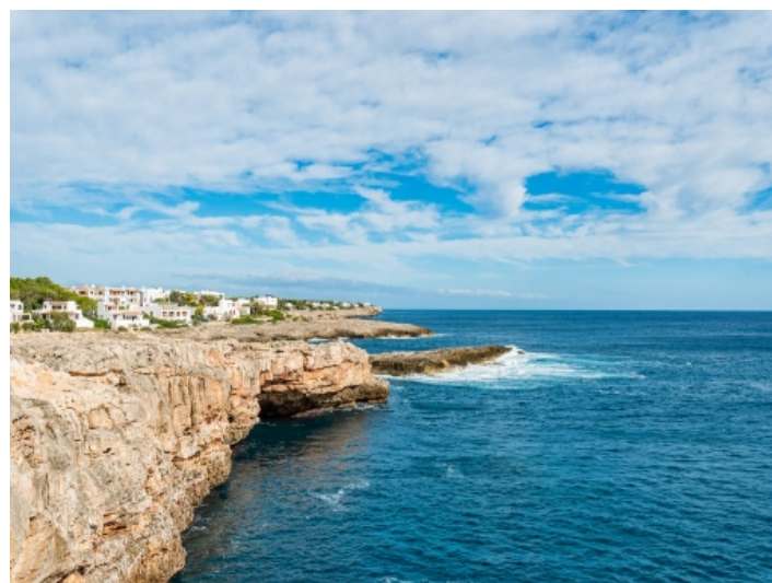
View of the coast