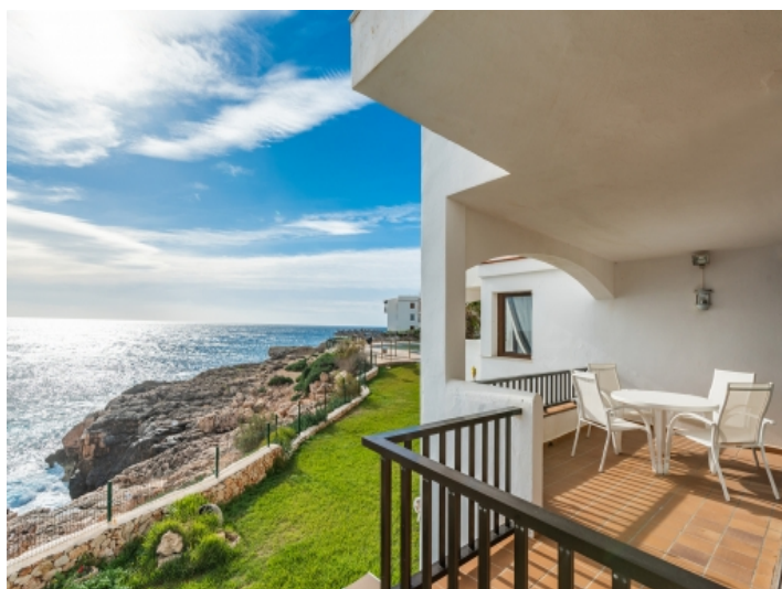
Stunning first sea line location