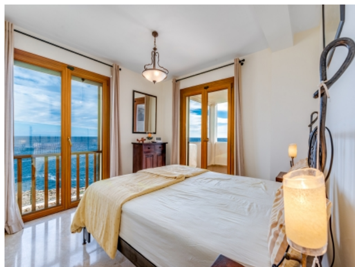
Dreamlike sea view bedroom