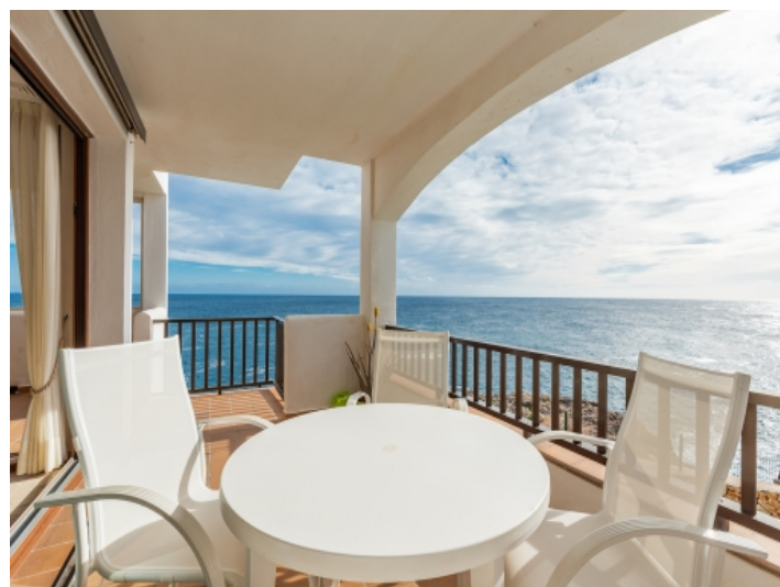
Terrace with panorama sea views