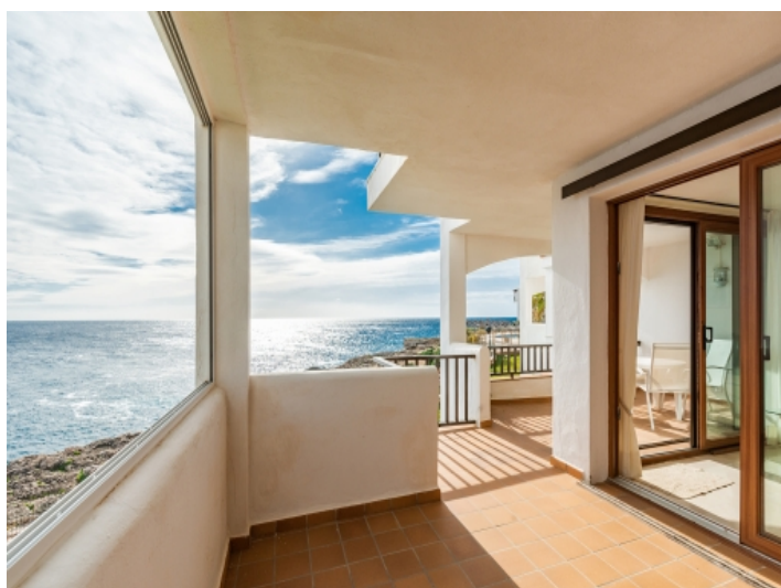
Covered sea view terrace