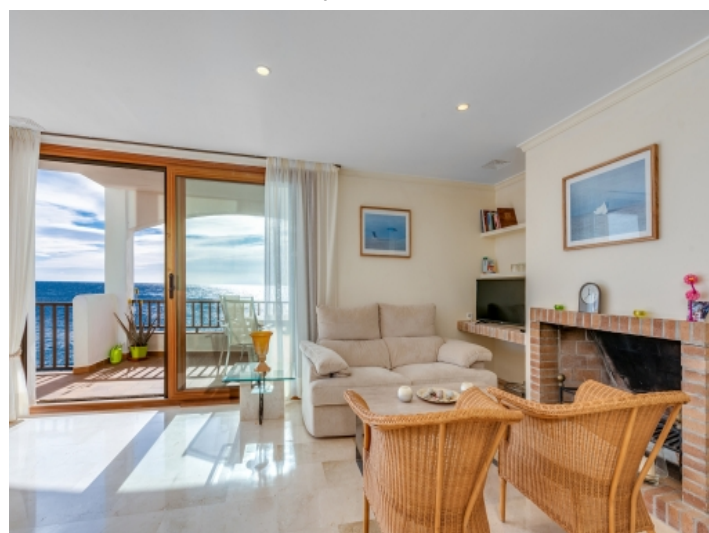
Sea view living area with fireplace