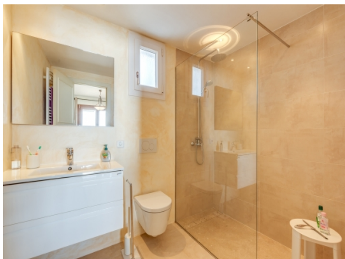
Modern shower bathroom