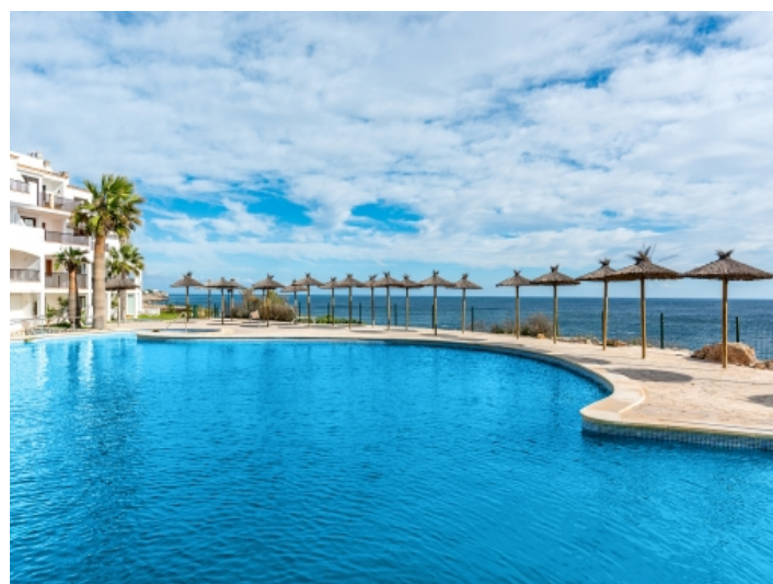
Large communal pool