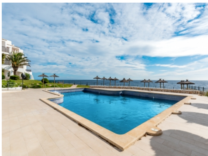
Pool in first sea line