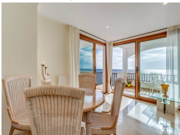
Sea view dining area