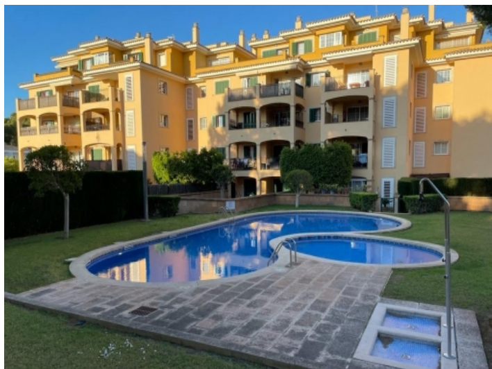
Communal pool area