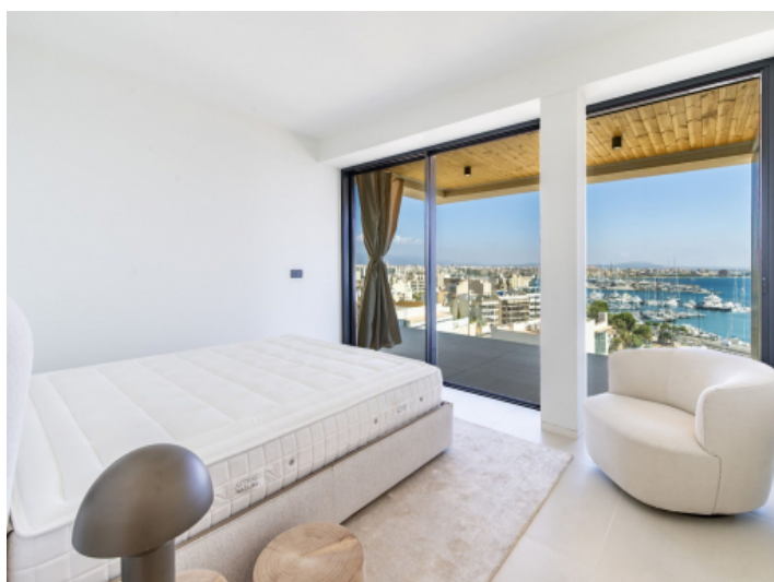
Penthouse with 3 bedrooms