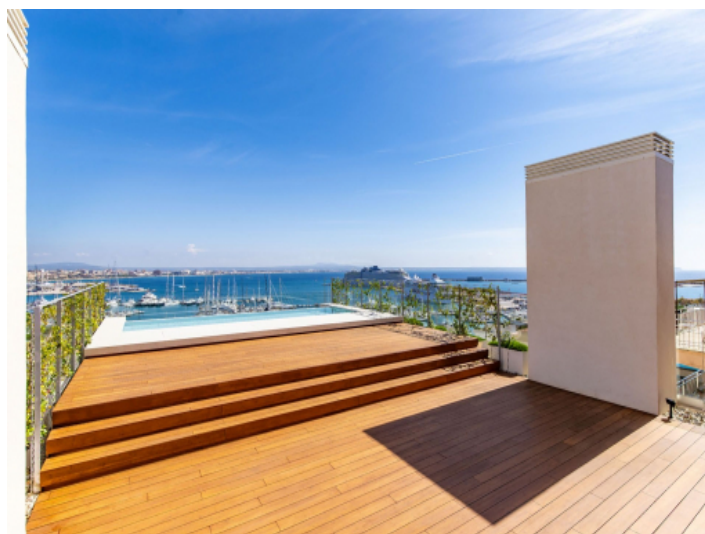
Large terrace with private pool